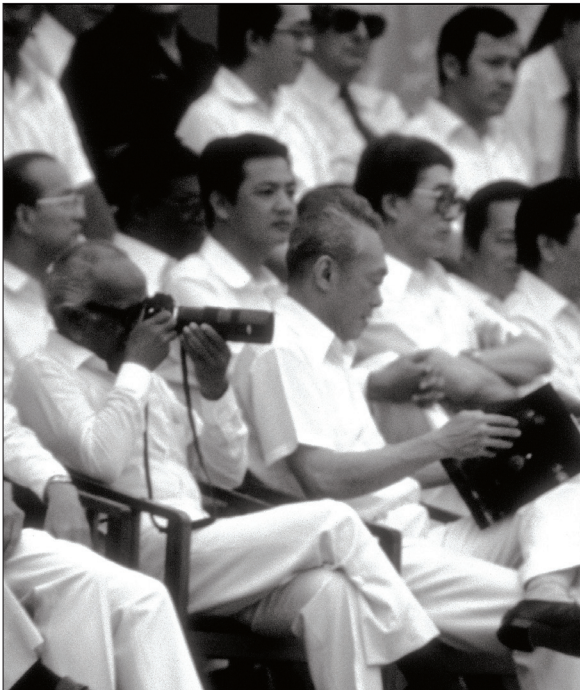
51. Left: He was equally passionate in pursuing his personal interests, particularly photography. He approached it as an art form and was often spotted with his camera, as seen here at the National Day Parade in 1982.