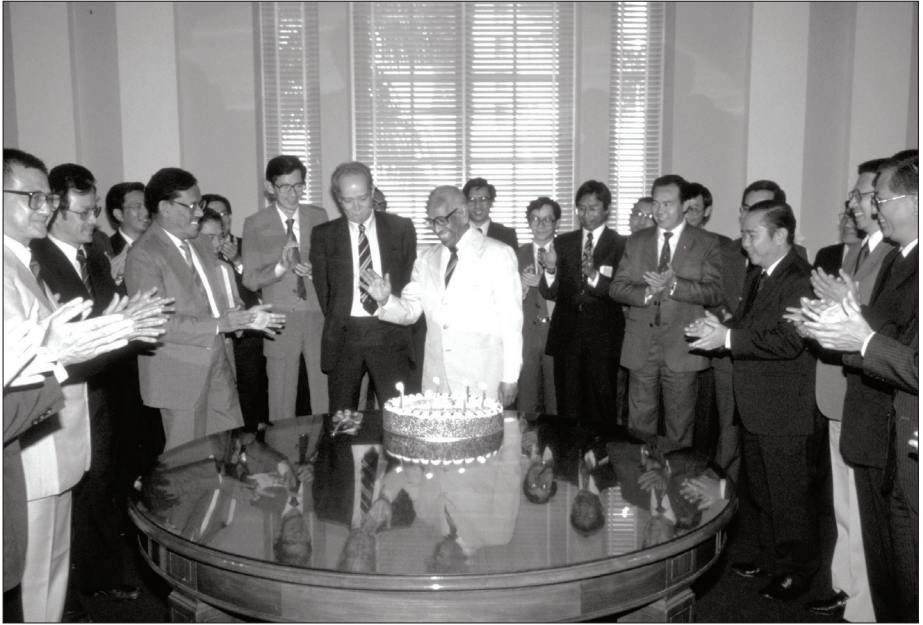
54. Ministers and MPs gather in the Members' Room in Parliament House to celebrate Raja's 70th birthday in February 1985. He is now Senior Minister in the Prime Minister's Office.