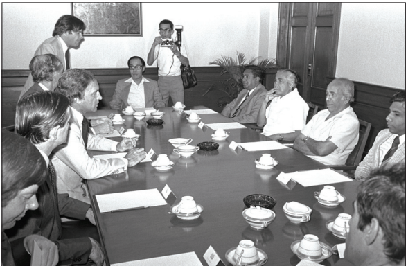
45. Right: Jan 1980: With Australian foreign minister Andrew Peacock and his delegation.