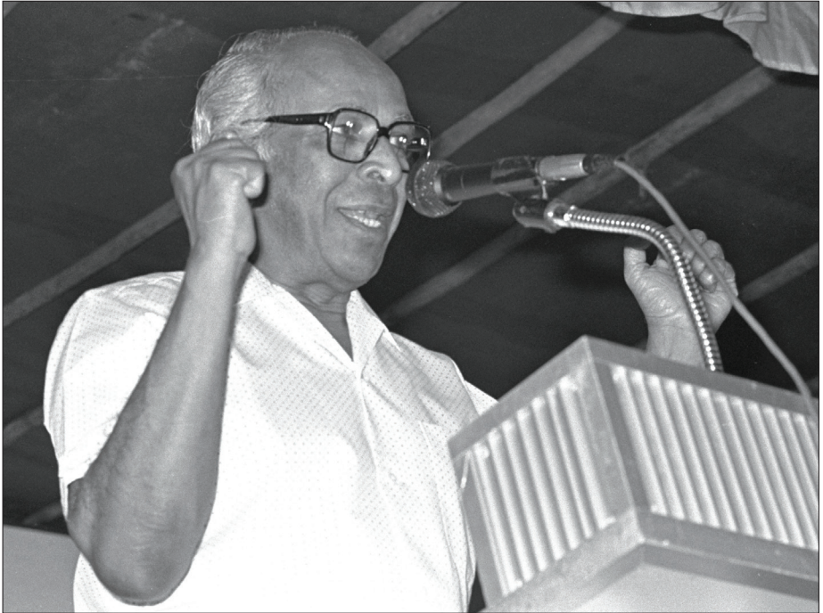
50. Above: At a grassroots event in 1983: He was passionate in pursuing his vision for Singapore and in persuading the people of its urgency.