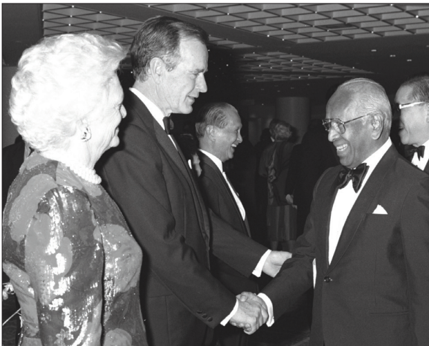
60. Raja continued attending official functions such as the state banquet for President of the United States George Bush, hosted by President Wee Kim Wee in 1992.