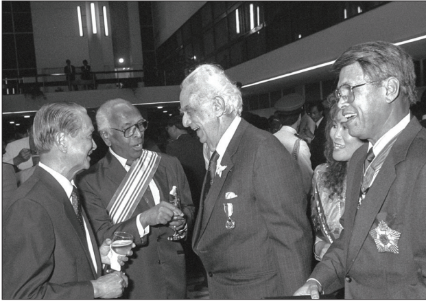
58. At the reception after receiving the Order of Temasek (First Class) at the National Day Award at the Singapore Conference Hall, 1990. From left: President Wee Kim Wee, Raja, ambassador to France, Portugal and Spain David Marshall (Meritorious Service Medal) and former minister Othman Wok (Order of Nila Utama, Second Class).