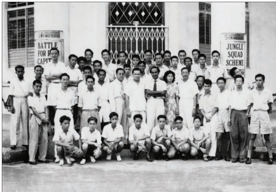
Famous journalist: Raja (centre, standing with arms folded) with the Singapore Standard staff. (NAS)