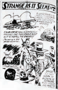
STRANGE AS IT SEEMS

It is a source of wonder to the Malay people that the Chinese and the Indian have been able to establish a community of interest in Malaya. It is a source of wonder to the Malay people that the Chinese and the Indian have been able to establish a community of interest in Malaya.