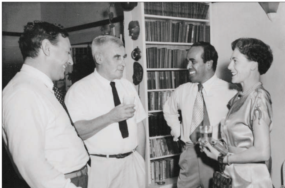
Dinner parties: Entertaining friends and contacts at his home in Chancery Lane in his younger days.