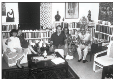
Above He continues to host friends in his house right up to his old age, as in this party in 1984.