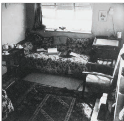
Left Home: Apartment at 89, Priory Road in West Hampstead, London. (NAS)