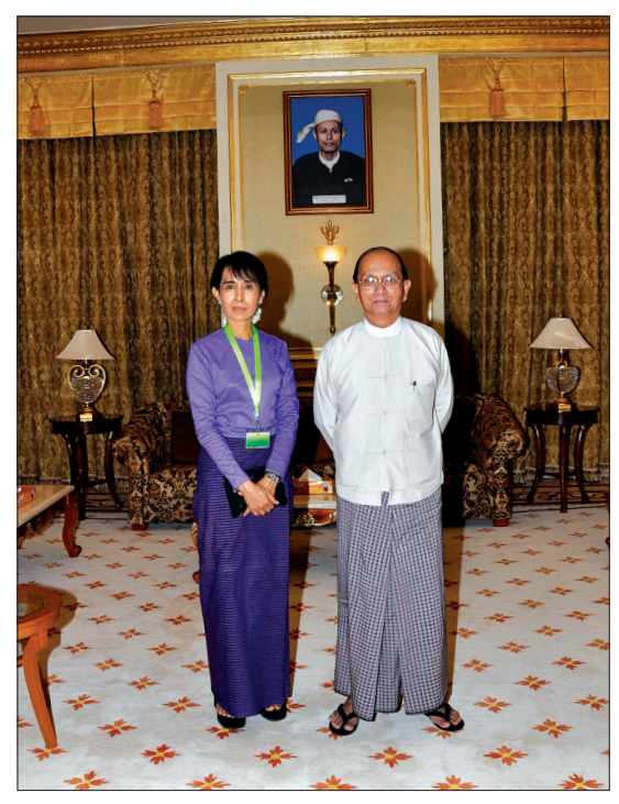
President Thein Sein met Aung San Suu Kyi on 14 August 2011. This meeting opened the door for Aung San Suu Kyi and her NLD party to enter hluttaws , but some ruling USDP party leaders criticized Thein Sein's decision.