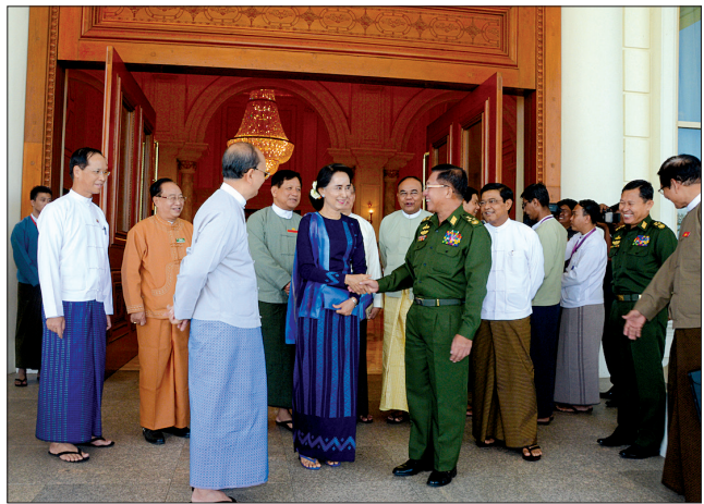
President Thein Sein, Commander in Chief Senior General Min Aung Hlaing and Aung San Suu Kyi at the Presidential Palace.

President Thein Sein and members of Egress after the president decided to meet with Aung San Suu Kyi (July 2011).