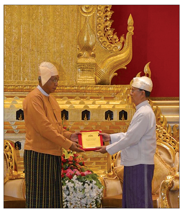
Transition of power on 30 March 2015. This was the first peaceful tranfer of power from one elected government to another since Myanmar gained independence in 1948.