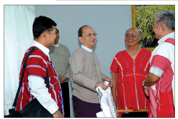
President Thein Sein and leaders of the Karen National Union during their informal meeting on the peace process.