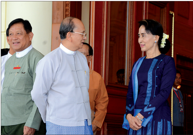
President Thein Sein and Aung San Suu Kyi at the Presidential Palace.