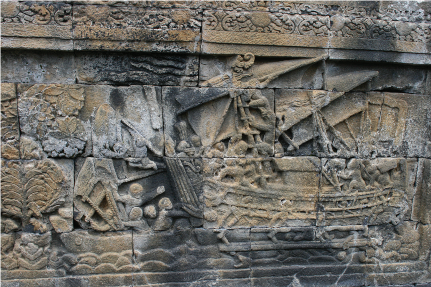
Two Types of Boat Shown at Borobudur