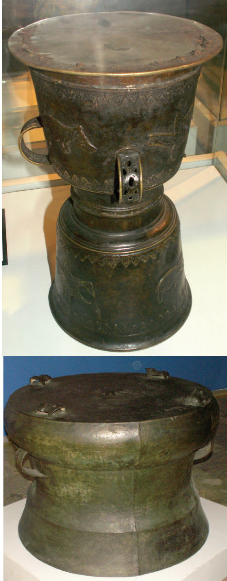
Moko and Classical Bronze Drum