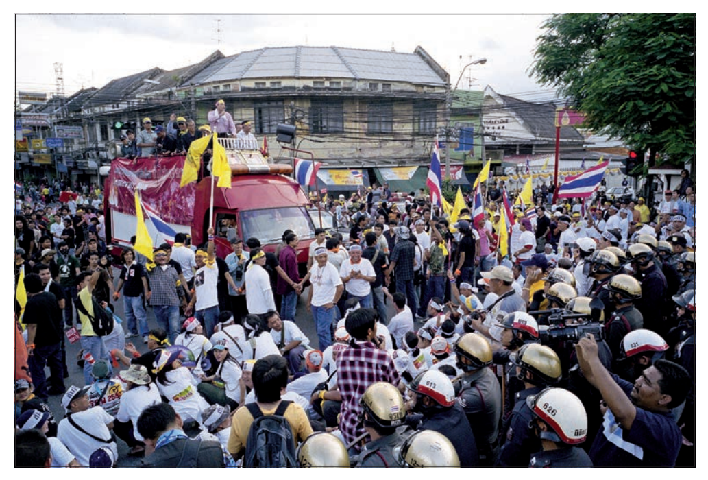
UDD protesters try to march to Privy Council chairman General Prem Tinsulanonda's residence, but were blocked by police, 1 July 2007.

Anti-coup protesters at Sanam Luang, 9 June 2007.