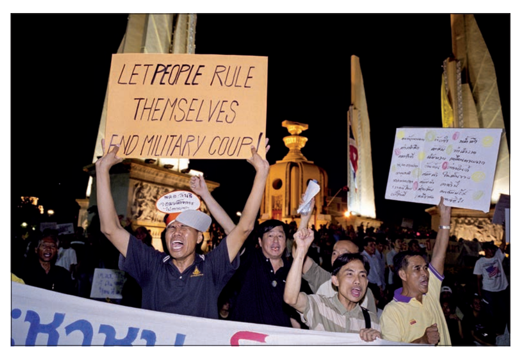
Anti-coup protesters at Democracy Monument, 10 December 2006.

Former Minister under the Thaksin government and deputy leader of the Thai Rak Thai Party Sudarat Keyuraphan is in tears and talks to Thai Rak Thai party supporters after the dissolution of the Party at the Party's headquarters, 30 May 2007.