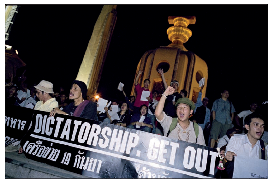
Anti-coup protest at Democracy Monument, 14 October 2006.

The Anti-19 September Coup Network protests at Parliament, 24 October 2006.