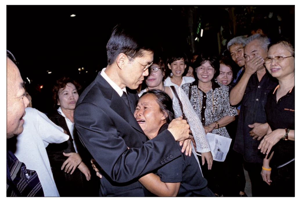
At Nuamthong Praiwan's funeral, former Justice Minister Pongthep Thepkanchana comforts a crying Thai Rak Thai Party supporter, 3 November 2006.

A small stage of the Saturday People against Dictatorship at Sanam Luang, 11 November 2006.