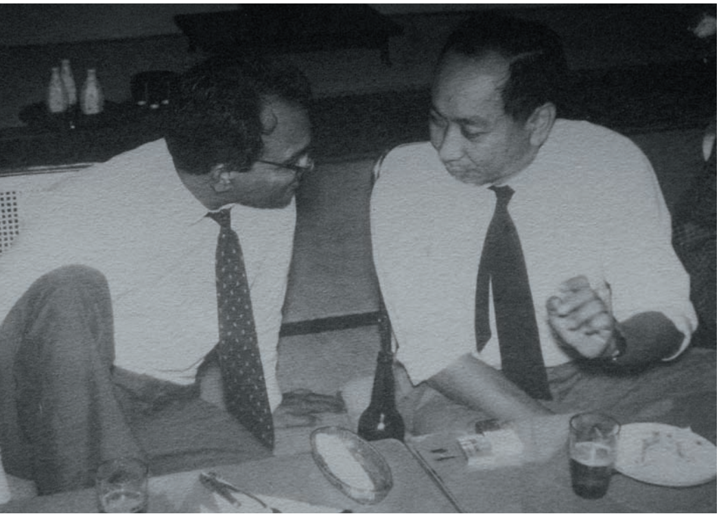
James with Goh Keng Swee, Singapore's Minister for Finance, after release from detention and appointment as head of the Singapore Industrial Board, 1959.