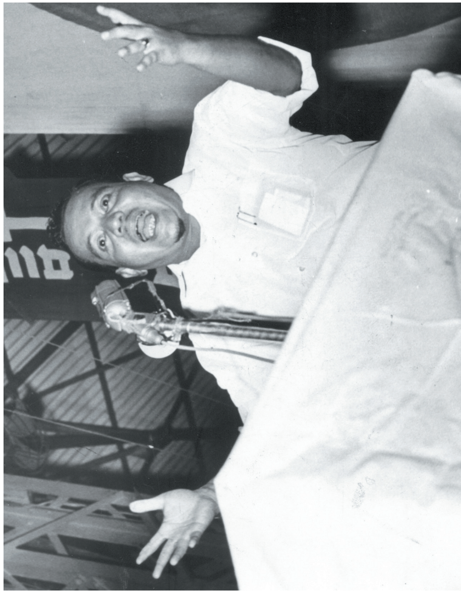
Ahmad Boestamam at a political rally, Malaysia, 30 January 1962.