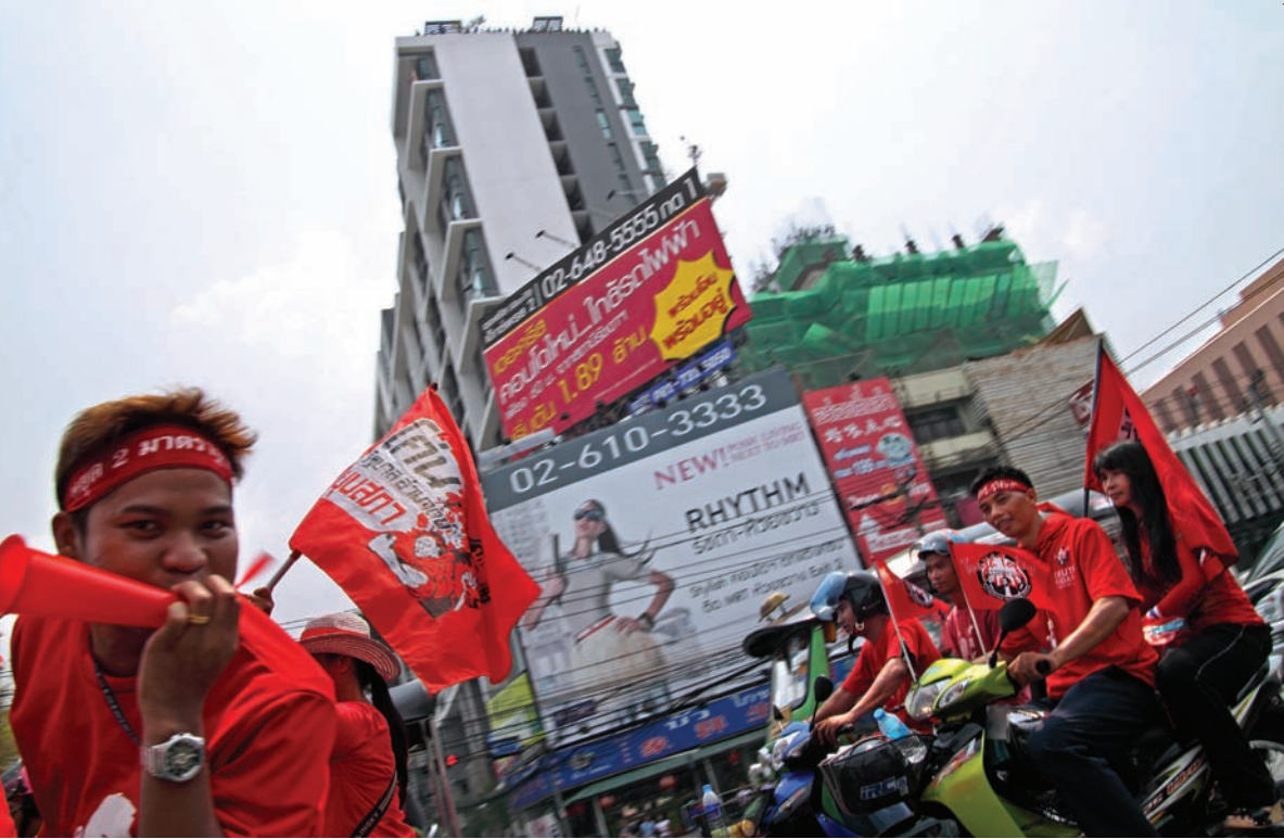
5. Red Shirt protestors in central Bangkok, 20 March 2010.