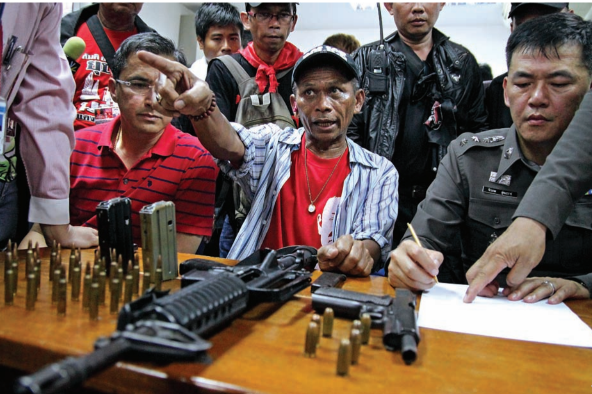
11. Red Shirt protesters hand over to the police weapons they have taken from a military police officer during their incursion into the Parliament grounds, 7 April 2010.