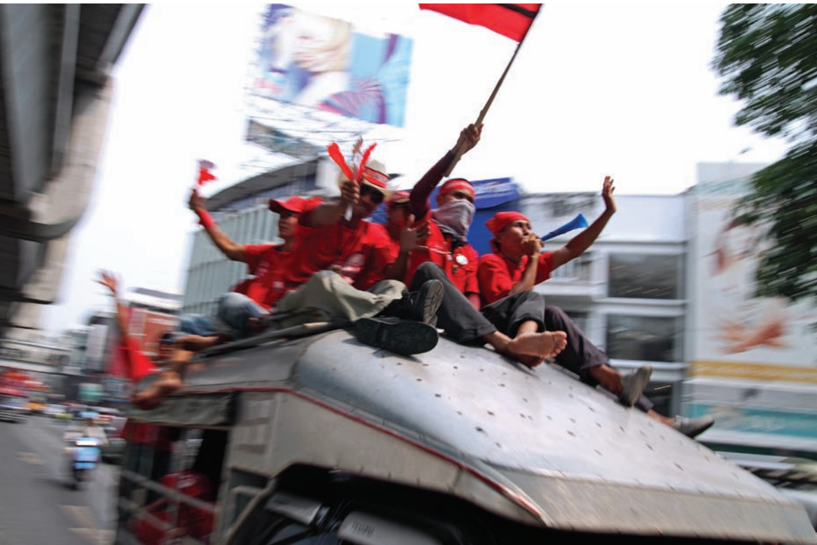
4. Red Shirt protestors on one of their protest caravans through Bangkok, 17 March 2010.