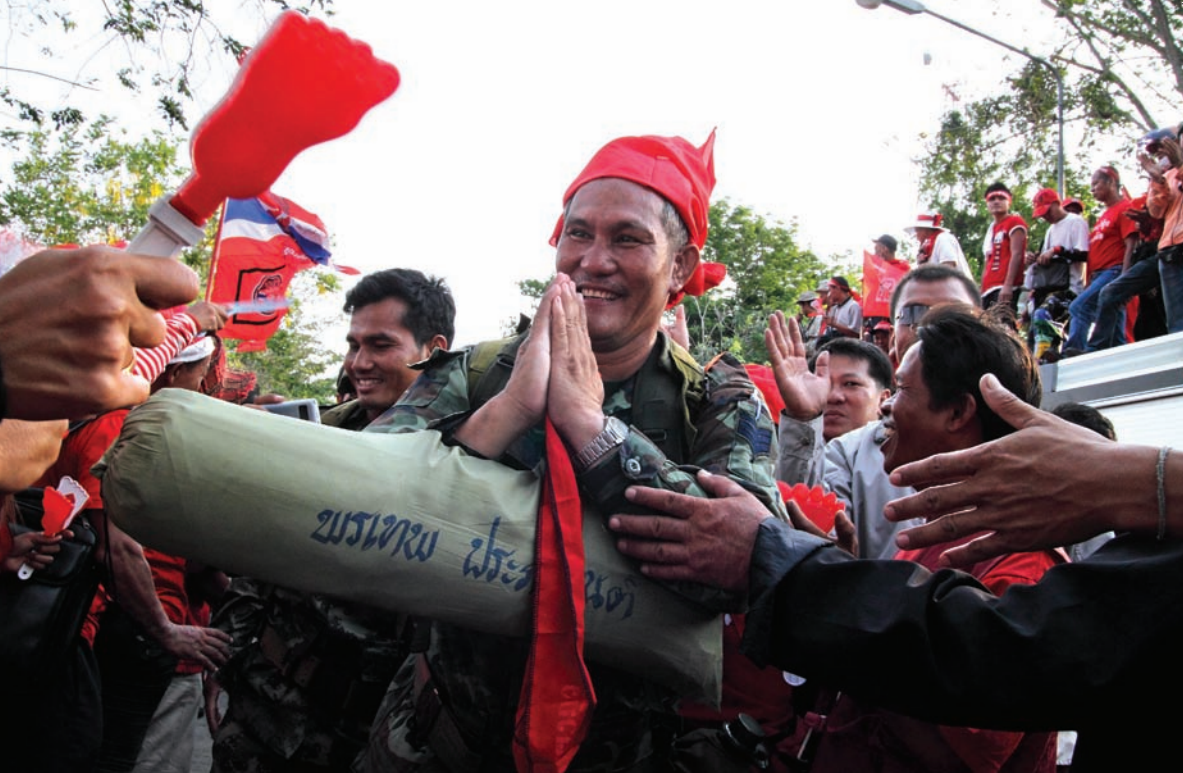
12. "Watermelon soldiers" — so-called for their sympathy with the Red Shirts — leave the Thaicom station after clashes between military and Red Shirt protestors, 9 April 2010.