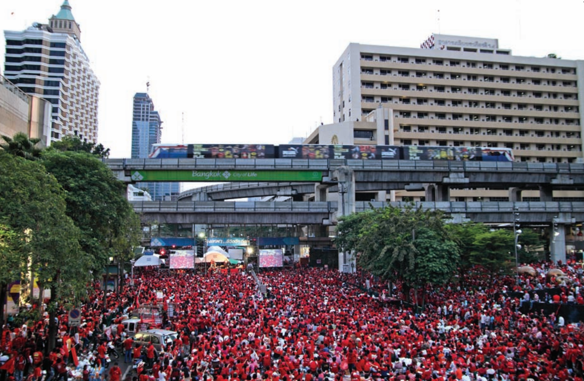
10. Ratchaprasong intersection, occupied by Red Shirt protesters, 4 April 2010.