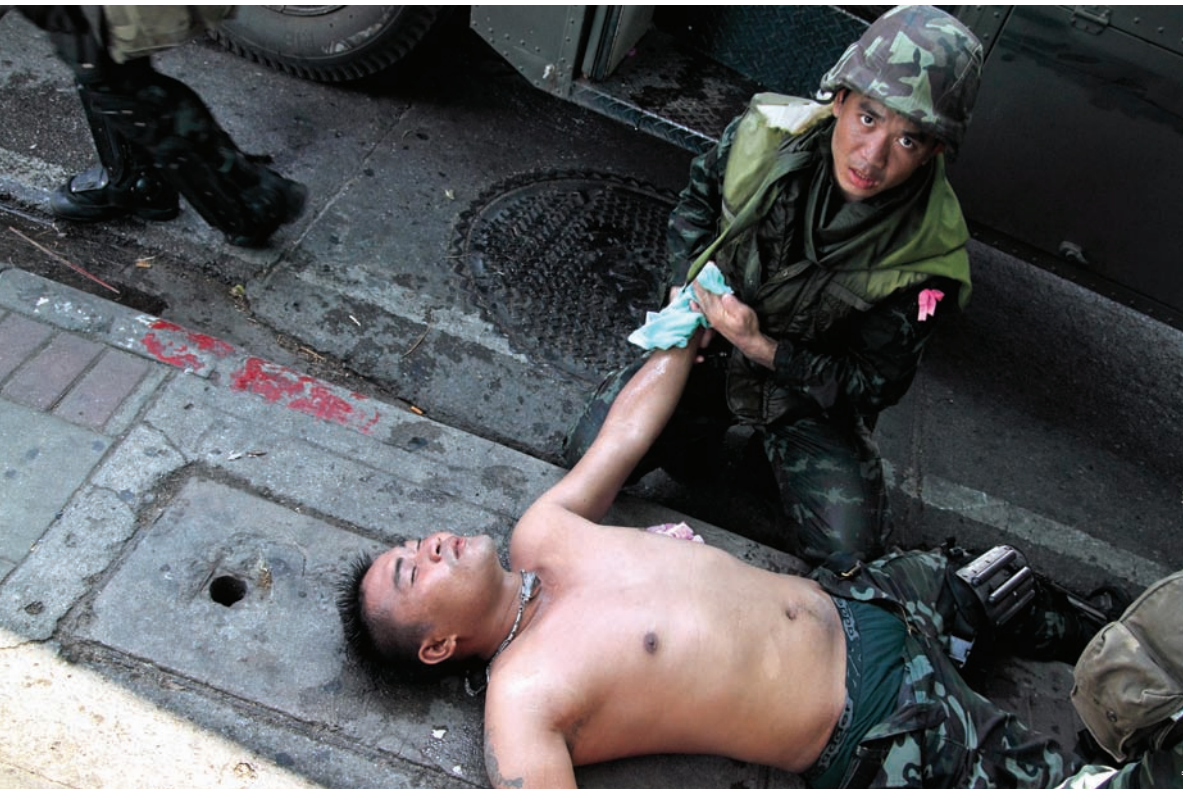
13. A soldier injured in the clashes of the afternoon of 10 April 2010.