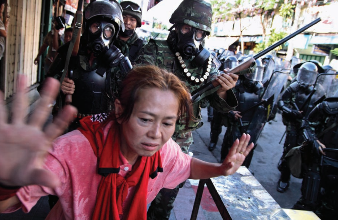
14. Forces of the 2nd Infantry Division begin the late-afternoon push at Dinso Road, 10 April 2010.