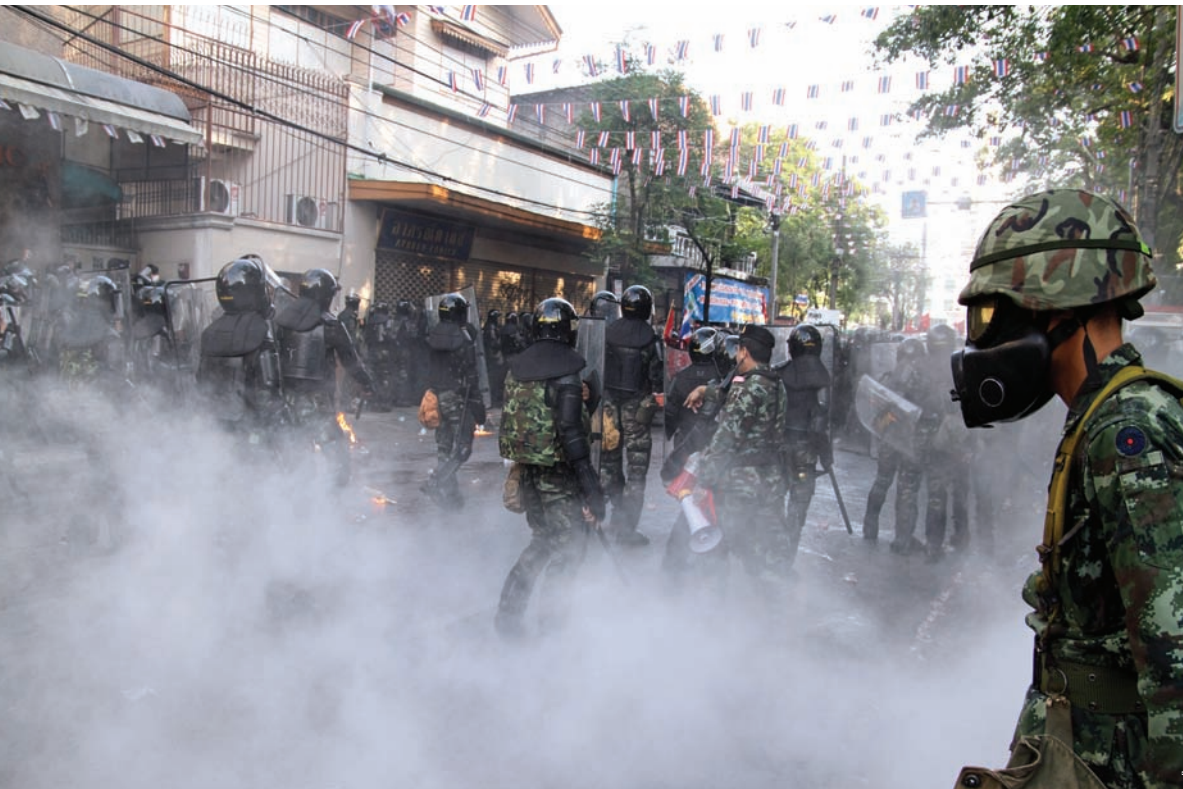
15. Soldiers engulfed by their own tear gas in Dinso Road, 10 April 2010.