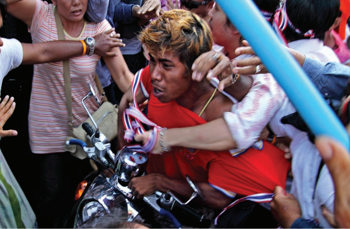
8. Pro-government protestors attack passing Red Shirt protestors, 2 April 2010.