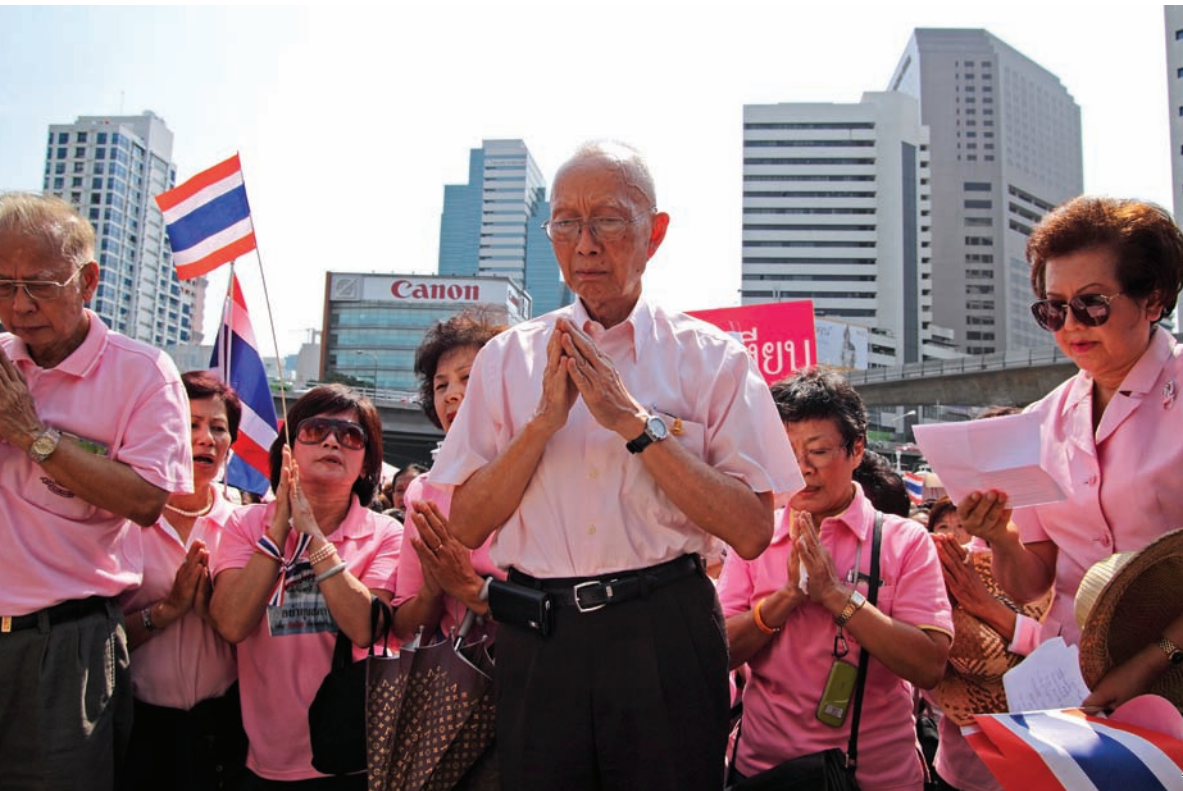
9. Retired Police General Wasit Dejkunchorn swears allegiance to the monarchy at a counter-protest against the Red Shirts. Not long after this, protestors attacked passing Red Shirts, 2 April 2010.