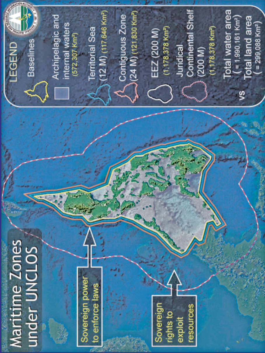
Figure 3. Maritime Zones under UNCLOS