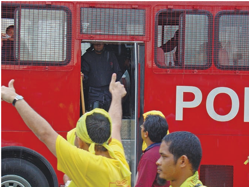
6. A demonstrator at the Bersih demonstration on 10 November 2007 in front of a police personnel vehicle.