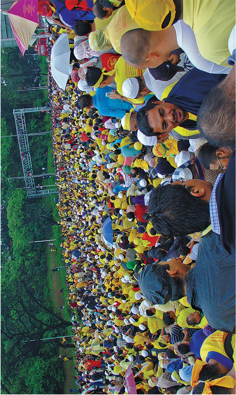
7. Part of the Bersih demonstration in Kuala Lumpur.