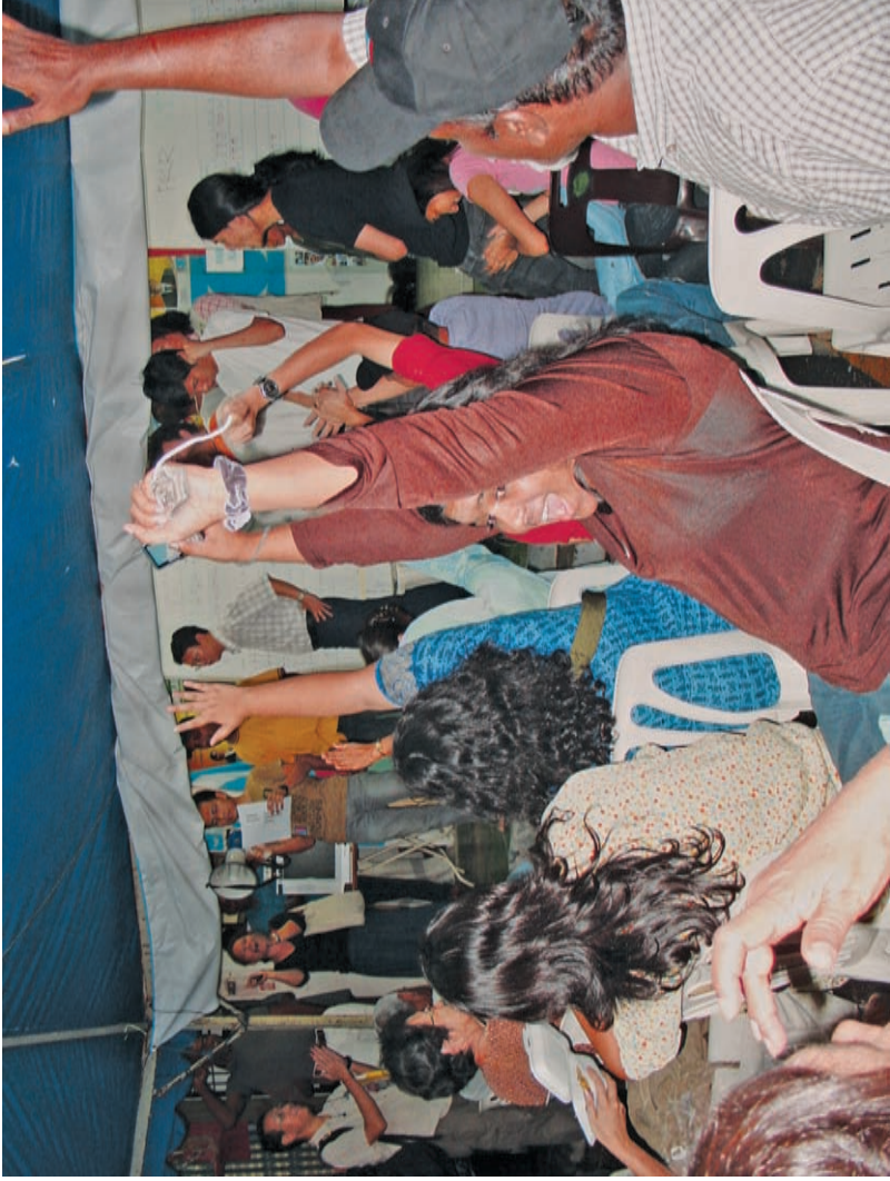
9. Supporters of PKR candidate Sivarasa Rasiyah celebrating as results of the elections came in on polling night, 8 March 2008.