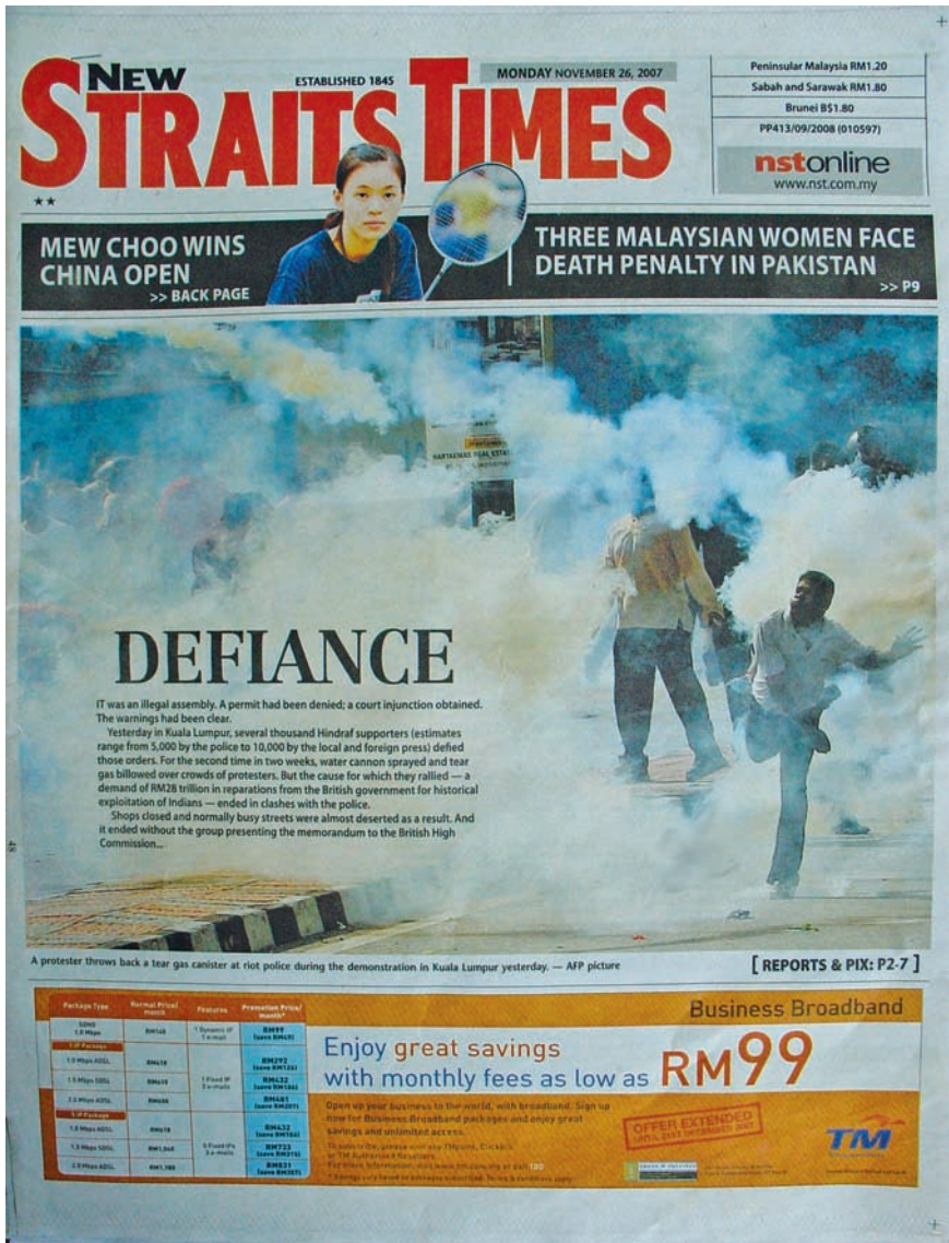
8. The front page of the New Straits Times on 26 November 2007. The main image depicts a demonstrator hurling a tear gas canister. The headline reads “Defiance”.