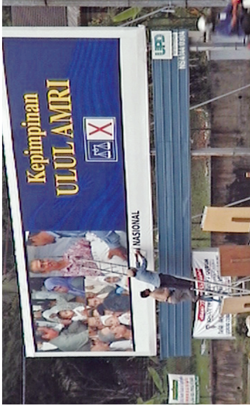
3. Workers covering up the phrase "Pilihan yang Bijak: Barisan Nasional" (The Smart Choice: National Front).