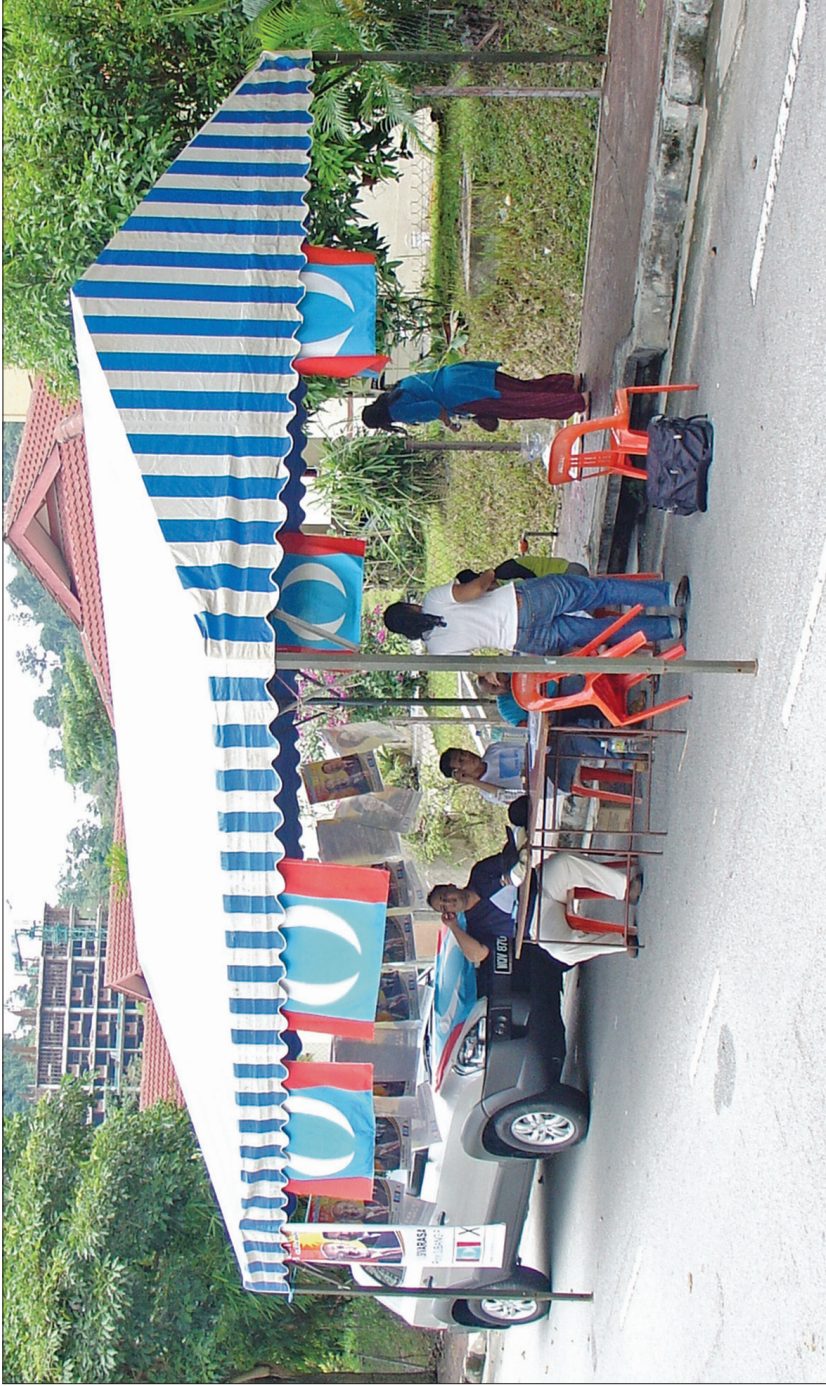
4. A PKR pondok panas set up on 8 March 2008, polling day.