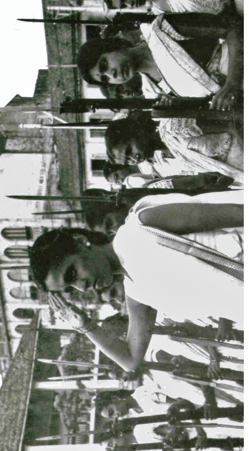
Volunteers for the Rani of Jhansi Regiment