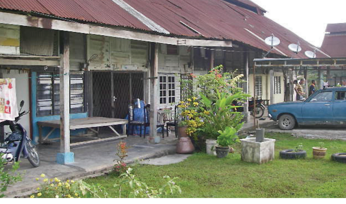
Contemporary photo of line houses