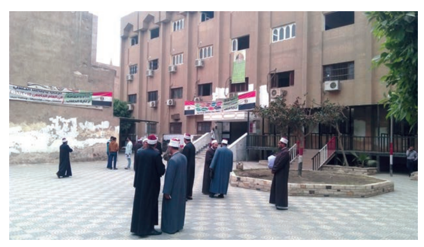
A glimpse of some of the academics at the university, dressed in traditional scholar garb.