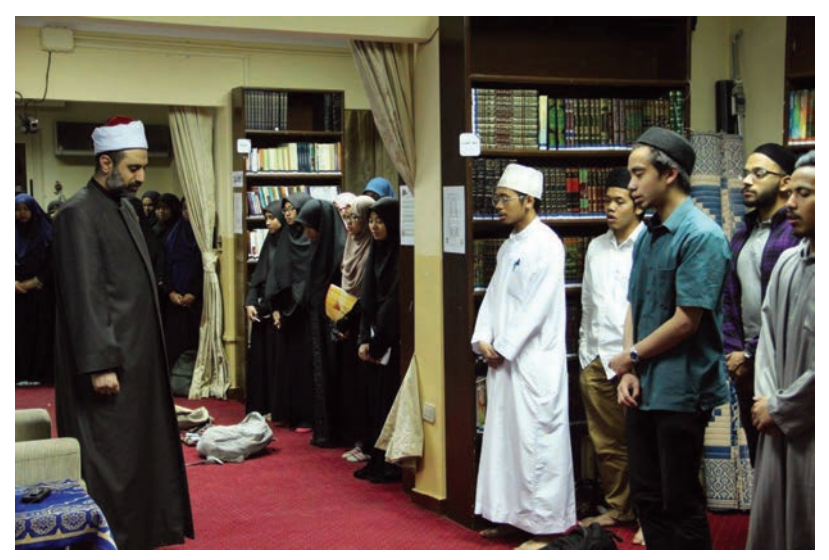
An invited scholar addressing Singapore Al-Azhar students. The visit was organized by Perkemas.