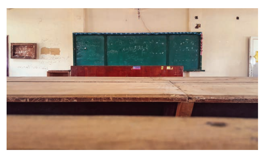
The Al-Azhar University has been the centre for traditional Islamic learning for aspiring ulama for centuries. This is the condition of its classrooms.