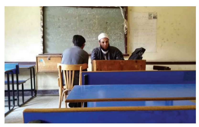
A lecturer conducting an oral examination.