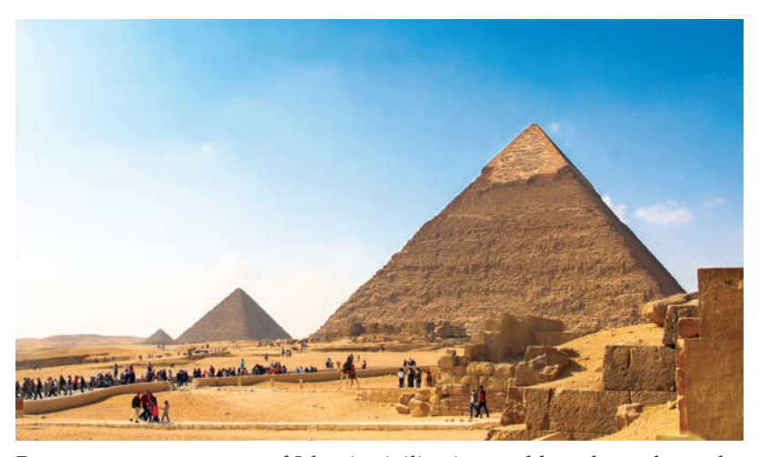
Egypt was once a centre of Islamic civilization and has always been the centre of Islamic learning. One of its main attractions is the pyramids.