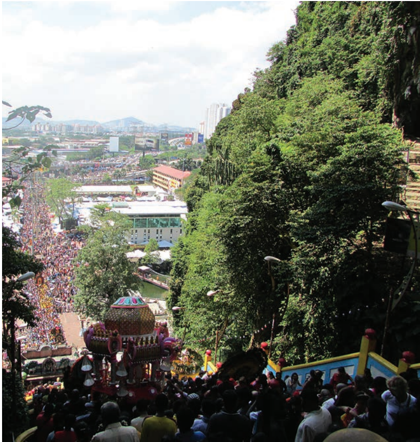
A crowd scene taken from the top of Batu Caves steps. Over a million people attend Thaipusam at Batu Caves each year.