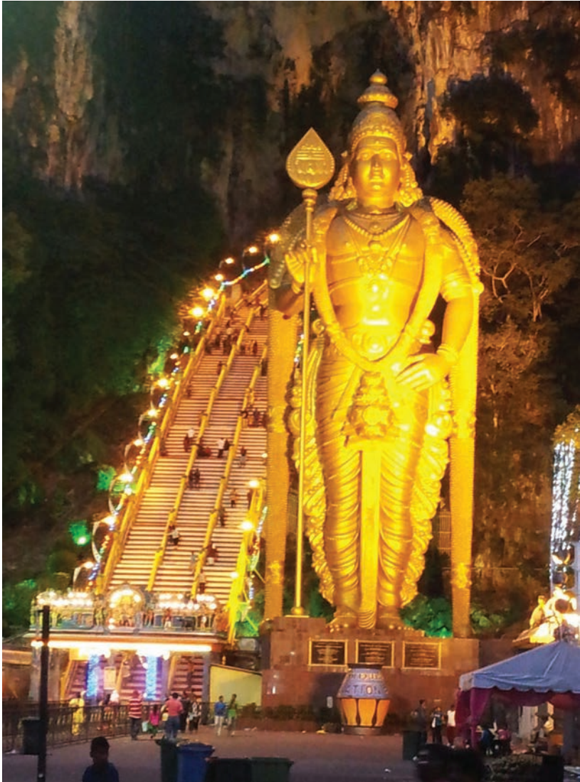
Preparing for Thaipusam: Batu Caves on a night leading up to the festival.