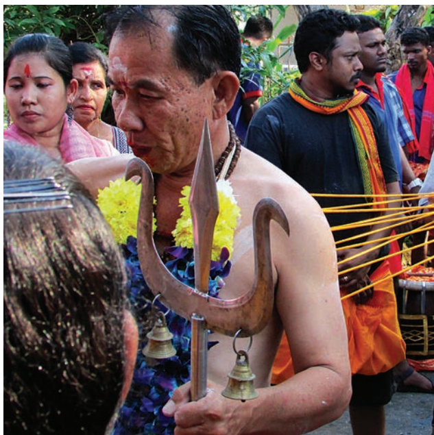
A Chinese devotee with a ter kavadi. The assistant holds the rope taut while the bearer makes his way to the shrine in the caves.