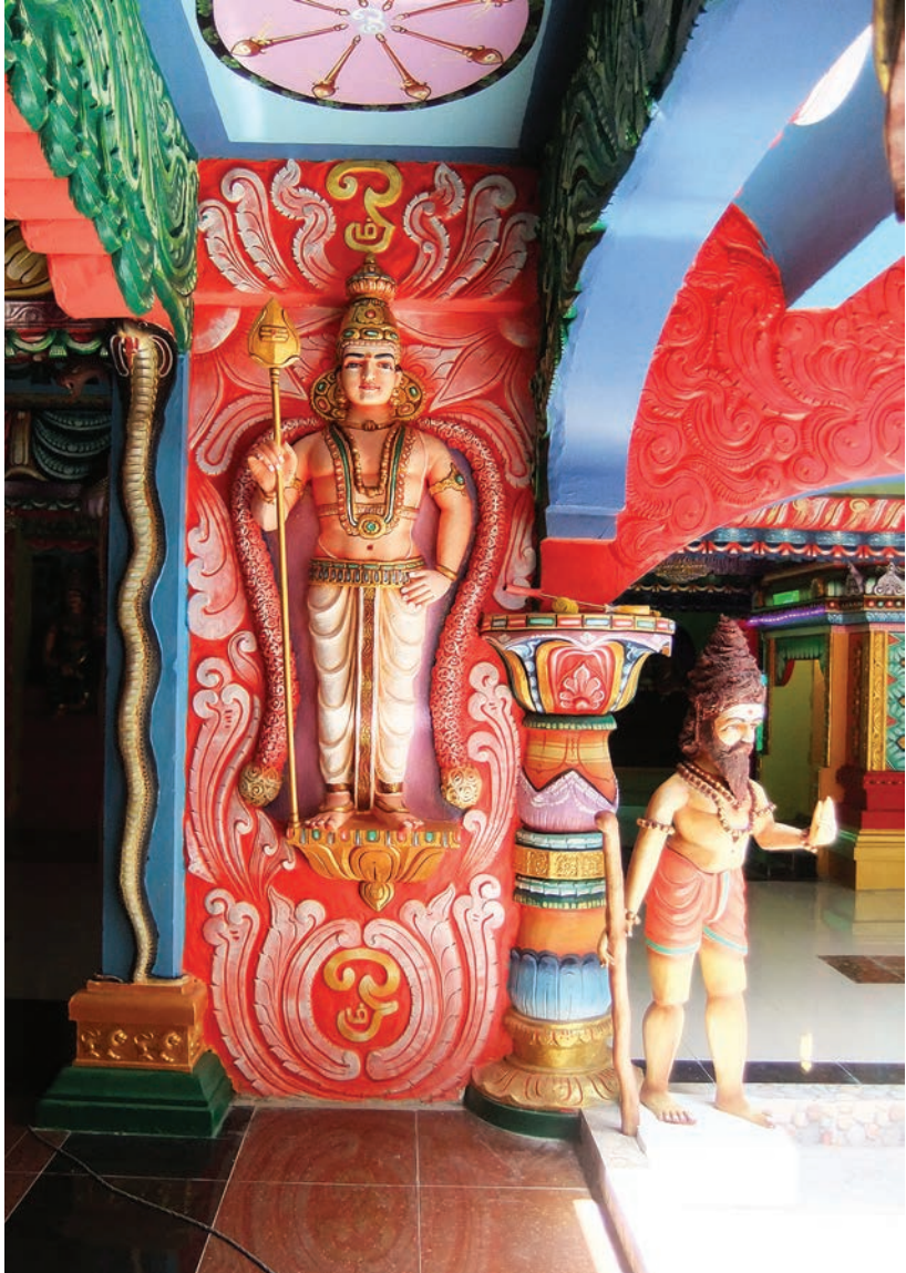
An image of Murugan with the sage Agastya. (Taken at the newly opened Om Sri Maha Nageswari Temple, Puchong, south of Kuala Lumpur.)