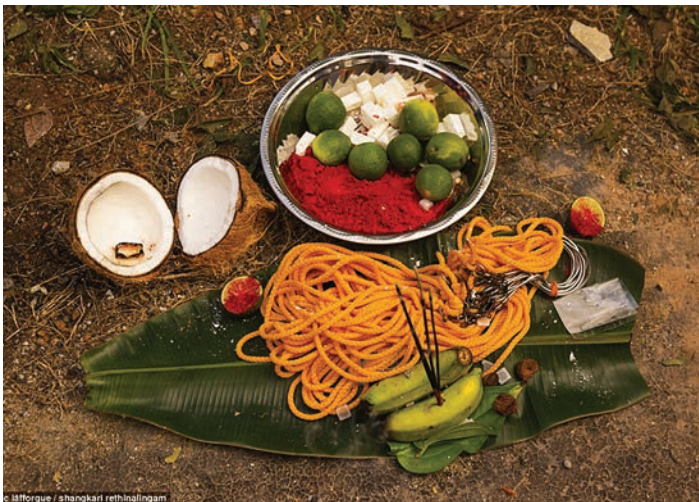
Altar setup.