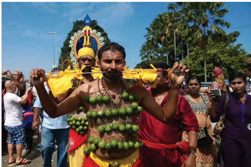
Devotees at Batu Caves.