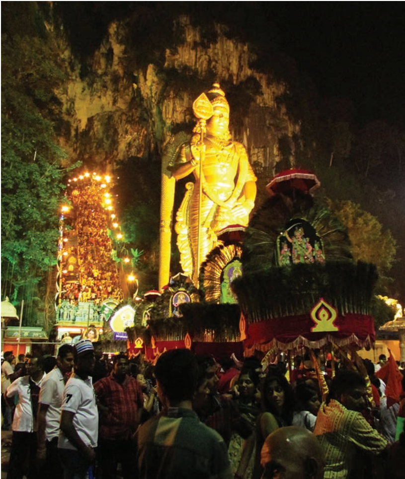
Thaipusam at Night: A series of mayil (peacock) kavadis are being borne towards the Batu Caves steps. © Krisztian Gal. Reproduced with permission.