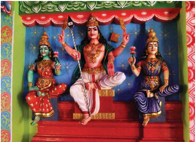
Statuary depicting Murugan and his consorts. From left: Valli, Murugan and Devayanai. (Taken at the newly opened Om Sri Maha Nageswari Temple, Puchong, south of Kuala Lumpur.)