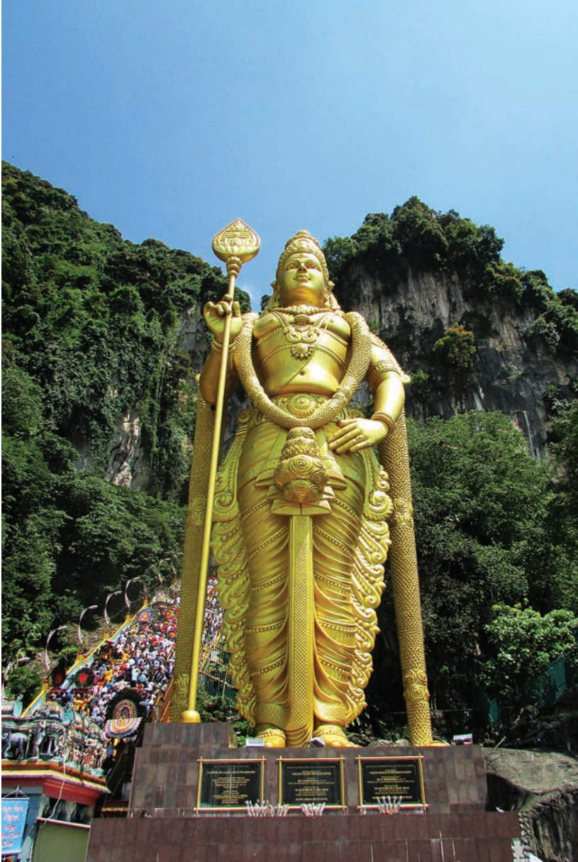
The statue of Lord Murugan at the foot of Batu Caves steps. Note the crowd on the steps. This continues throughout the entire period of the Thaipusam festival.