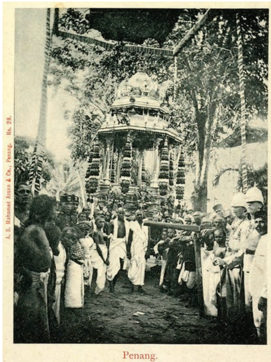
Chettiars with the Silver Chariot, Penang. Postcard circa 1910.