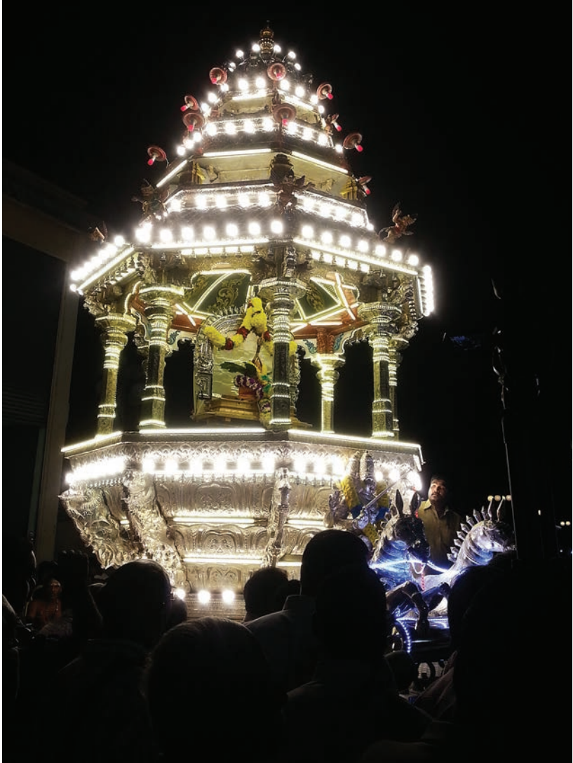
Chariot at night.