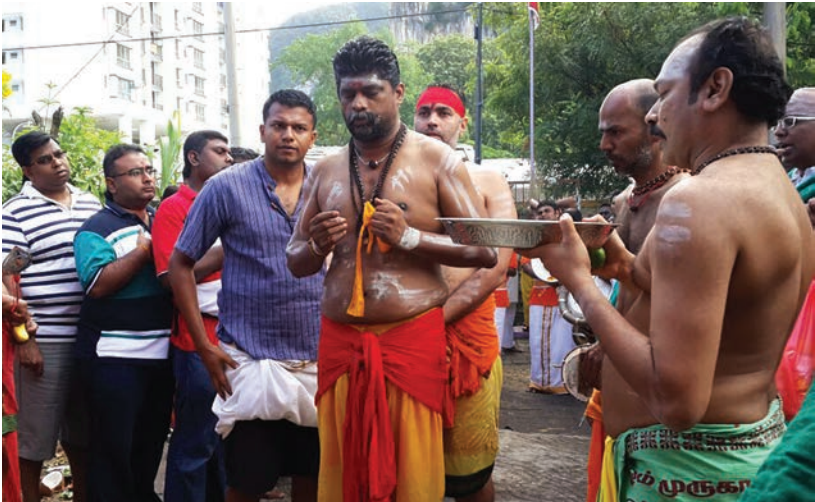
Devotees preparing to enter trance.