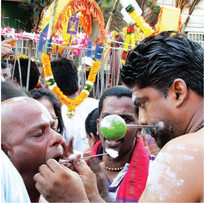
An entranced devotee undergoing the insertion of a vel . This one is being pushed through the cheeks.