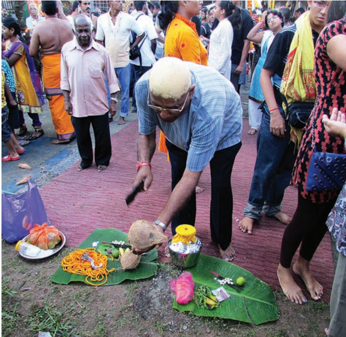
Preparing the kavadi altar – each kavadi has its own altar.