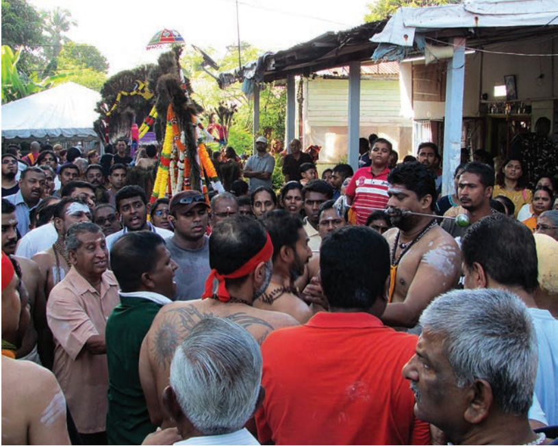
A devotee preparing for trance. The surrounding crowd demonstrates the public scrutiny each devotee must endure and the pressures to attain trance.