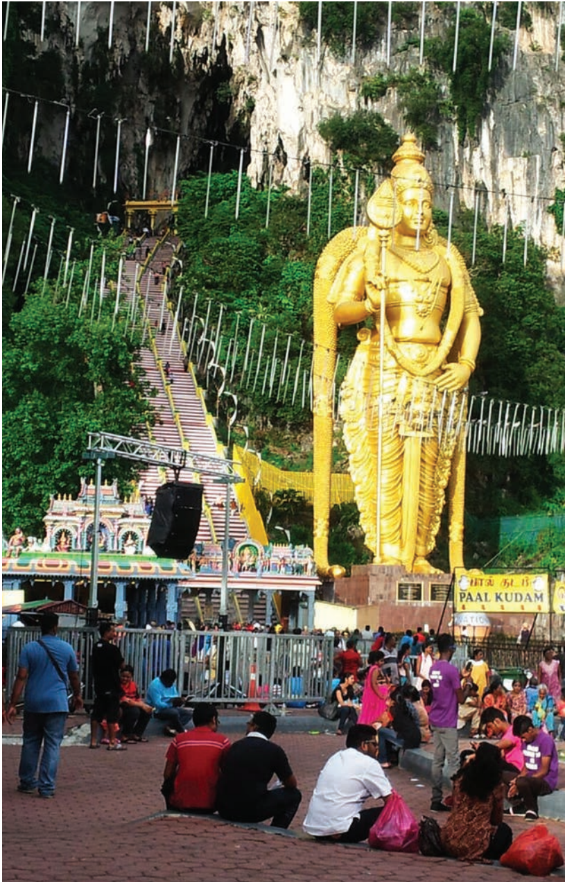
Batu Caves statue of Murugan.