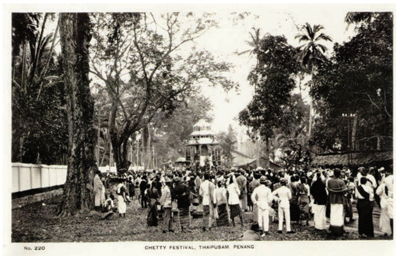
Thaipusam in Penang. Postcard circa 1940.