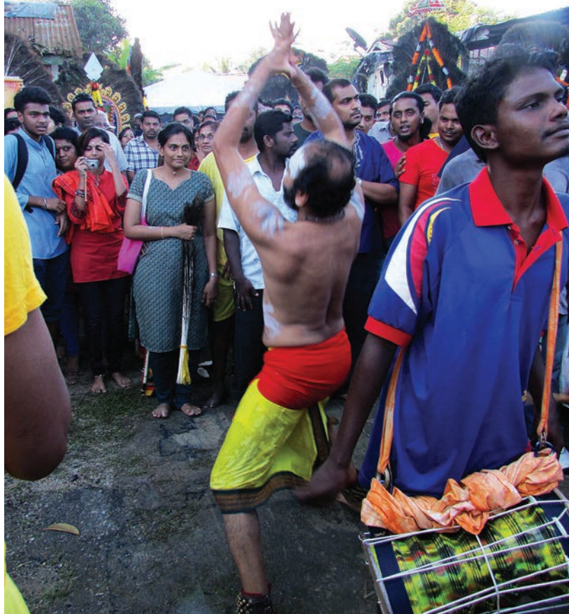
A devotee at the onset of the state of trance ( arul ).