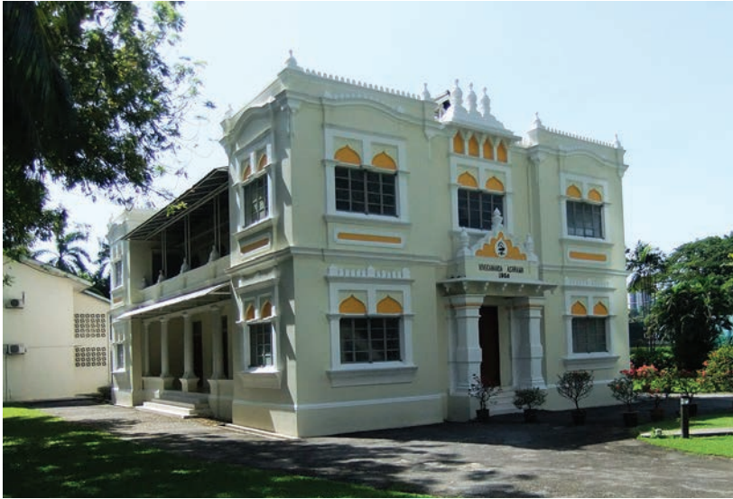
Sri Vivekananda Ashram, Brickfields, Kuala Lumpur: A landmark in Malaysian Hinduism.