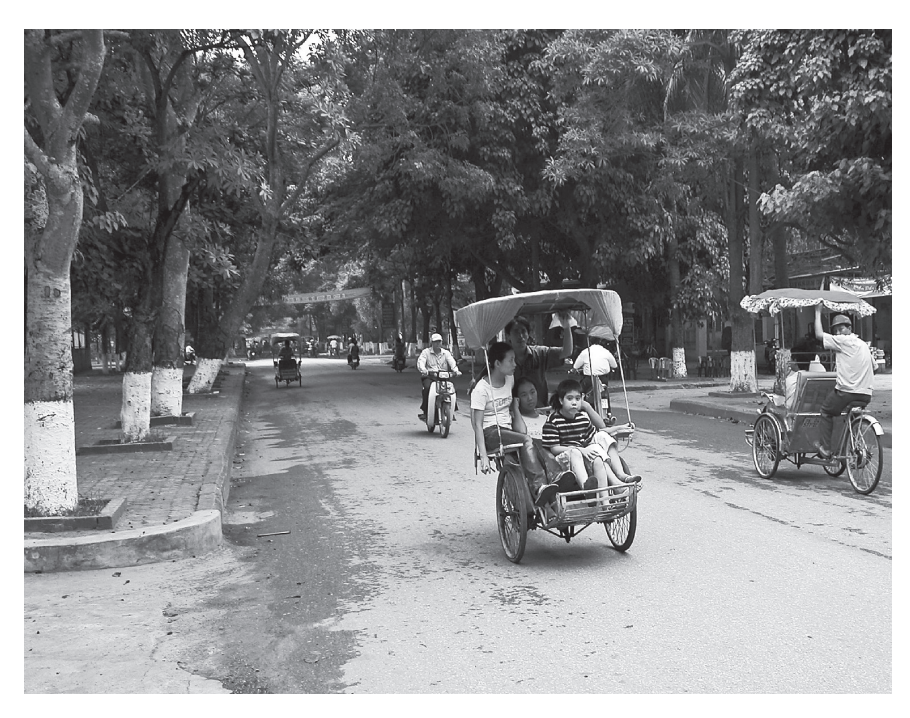
Hai Phong: Sunday stroll in a cyclo.