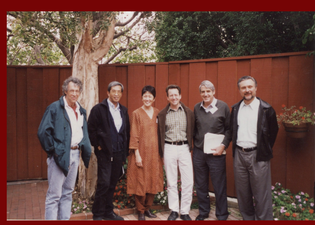
With colleagues at the University of California Los Angeles in 2000.