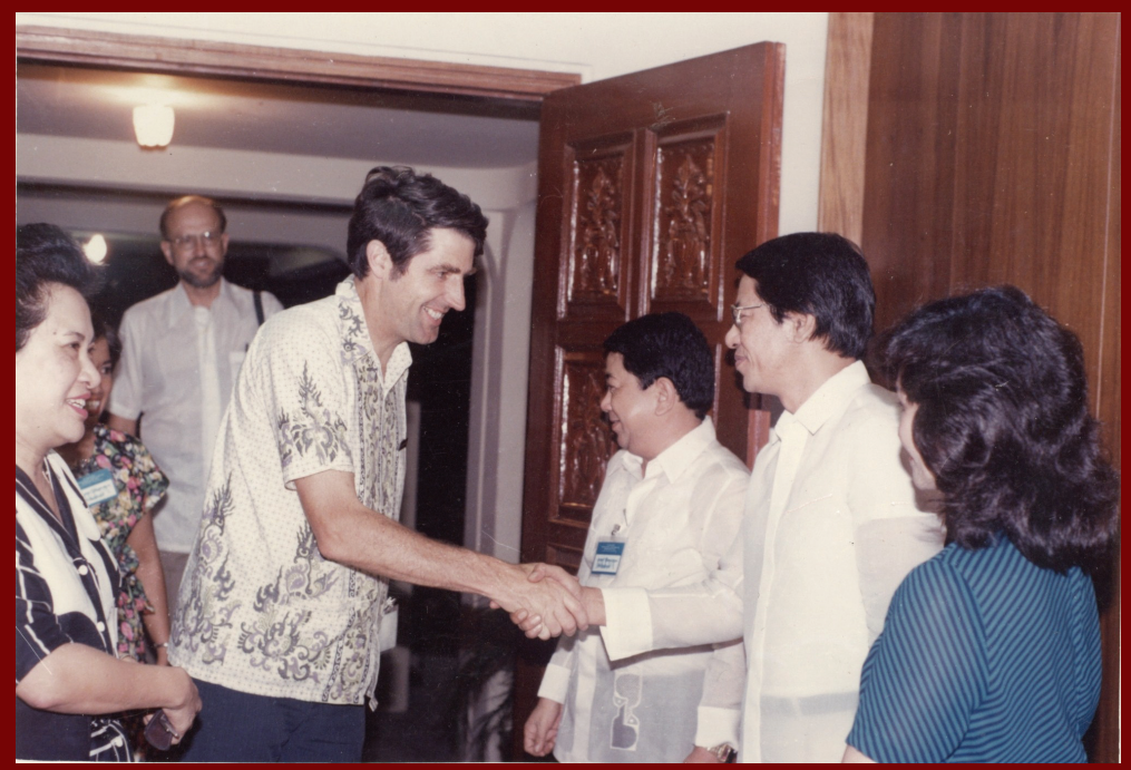
Attending the International Association of Historians of Asia conference in Manila in 1983.