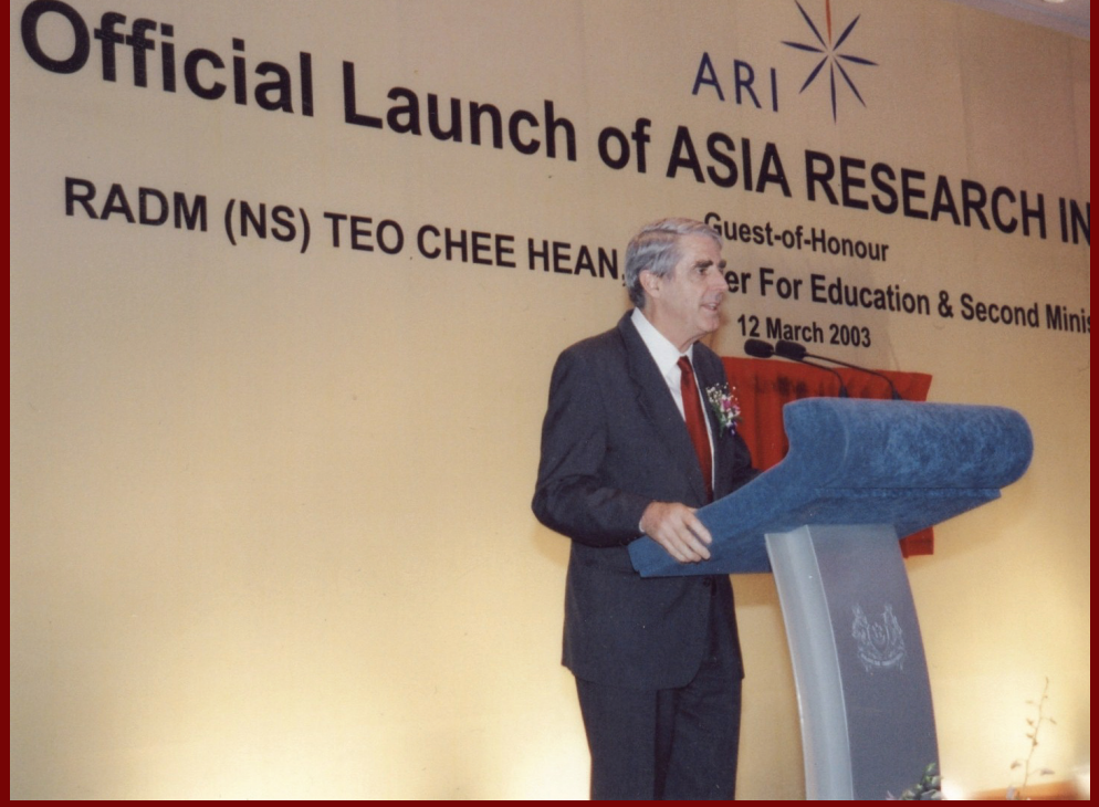
Launch of the Asia Research Institute at NUS in Singapore, 2003.