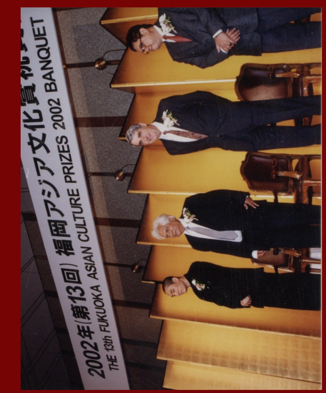
Fukuoka Asian Culture Prize winner in 2002.