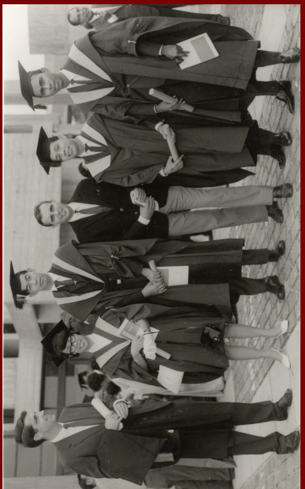
With graduates and colleagues at a University of Malaya graduation ceremony, late 1960s.