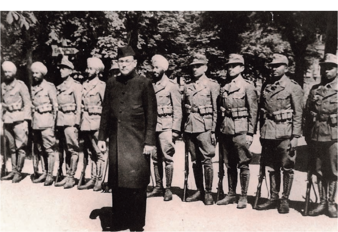
With the first officers of the Indian Legion, Europe, 1942. Source: Courtesy of the Netaji Research Bureau.

Travelling with an Italian passport: disguised as Orlando Mazzotta, 1941. Source: Courtesy of the Netaji Research Bureau.