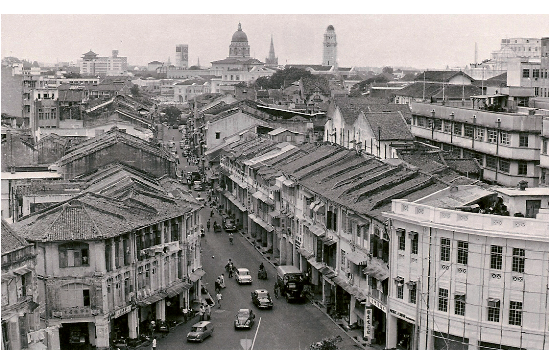
Market Street — mainly pre-war shophouses, 1970

Buildings at Market Street, 1980