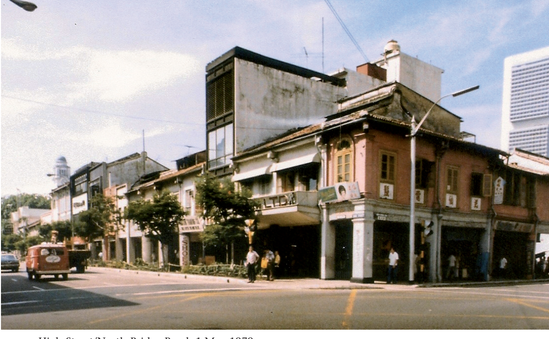
High Street/North Bridge Road, 1 May 1979

Little India just before Deepavali