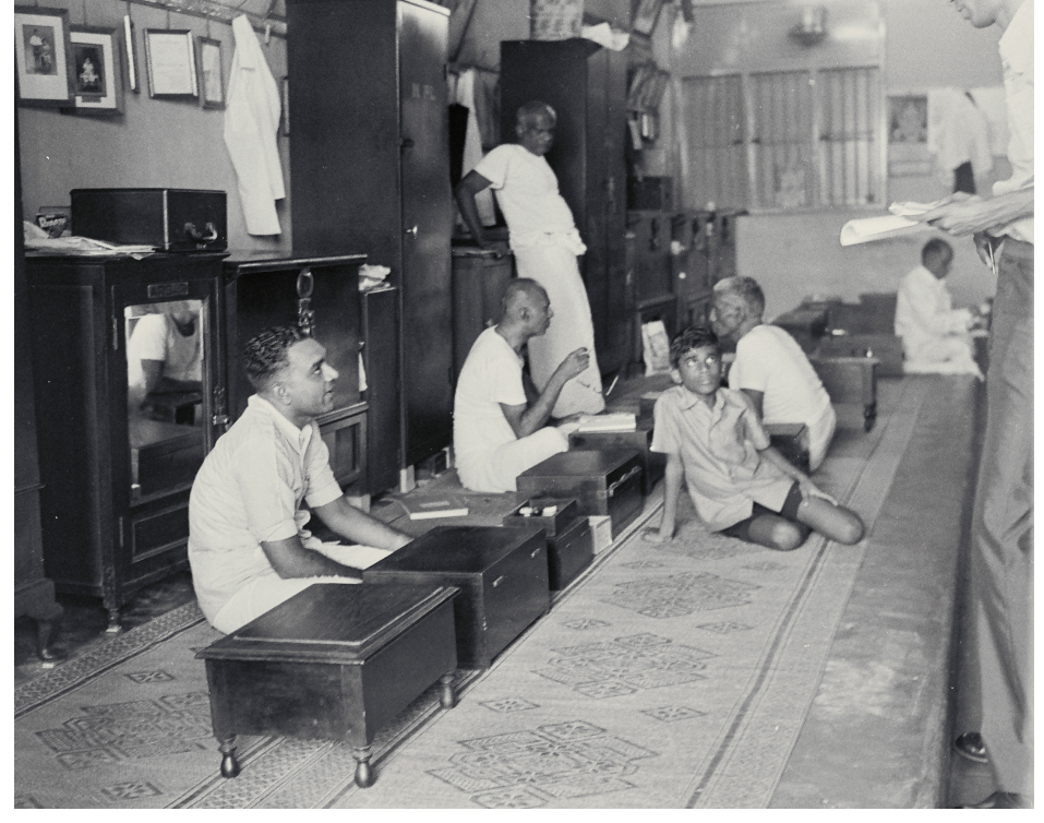
Market Street — Chettiar moneylenders, 6 November 1975 Source : Singapore Press Holdings Ltd. Reproduced with permission.

Reflections of the past — inside the kittingi at 5 Tank Road Source : Photo taken by the author, 25 October 2008.