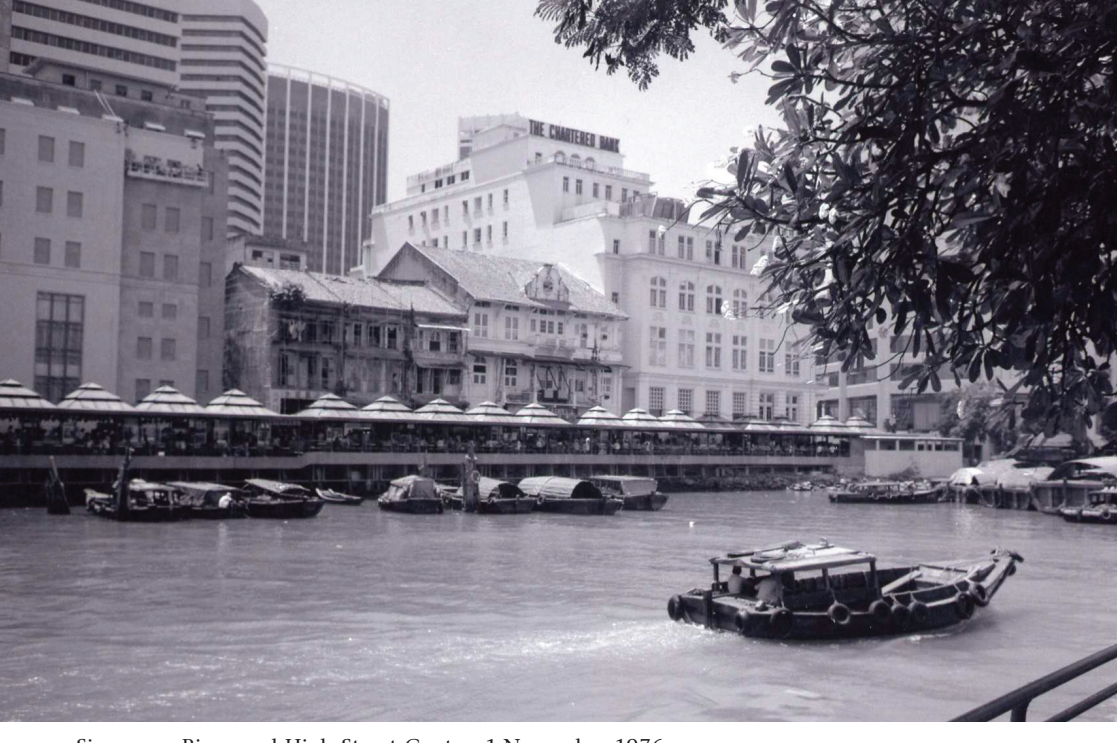
Singapore River and High Street Centre, 1 November 1976

Changing landscapes: Singapore River at present