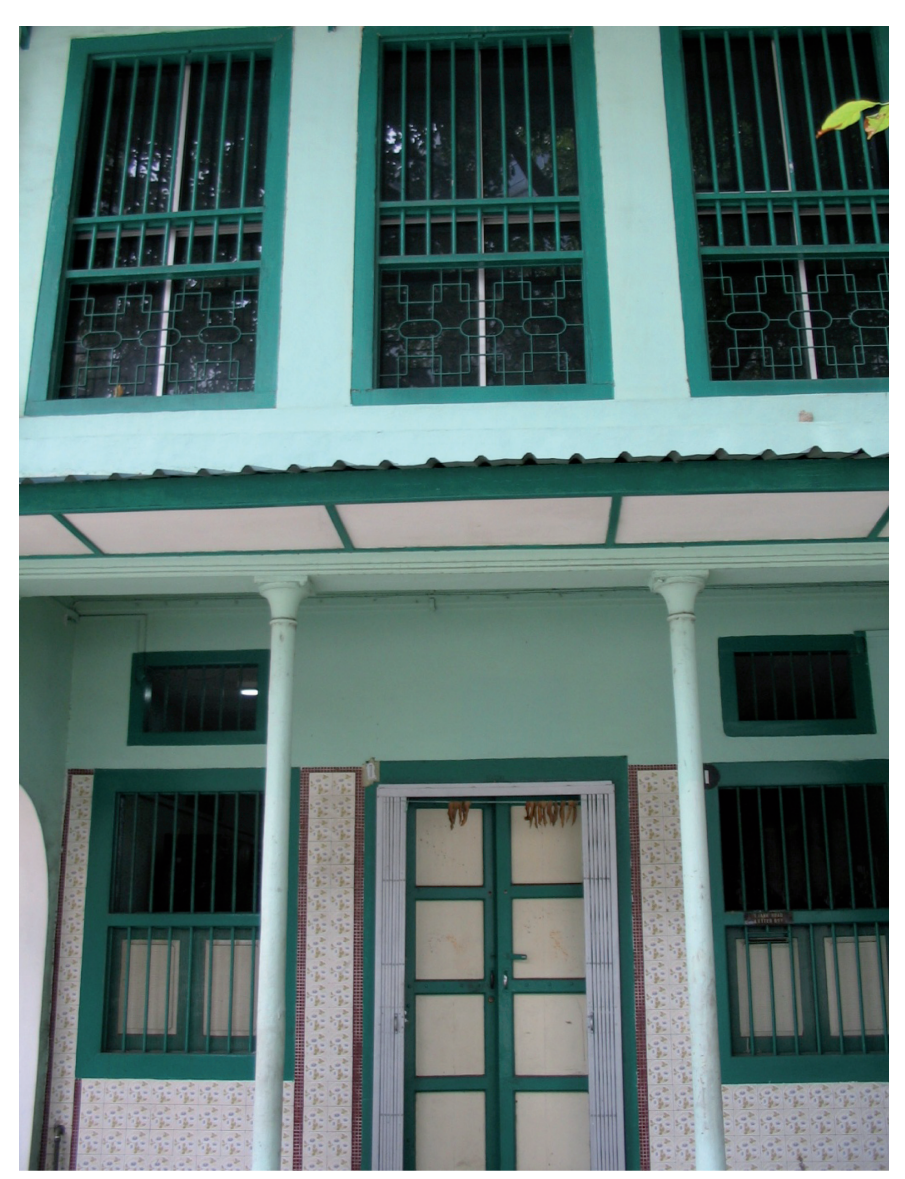
Old order and the new: the Nagarathar Building at 5 Tank Road retains the kittingi shophouse structure.

25 October 2008.