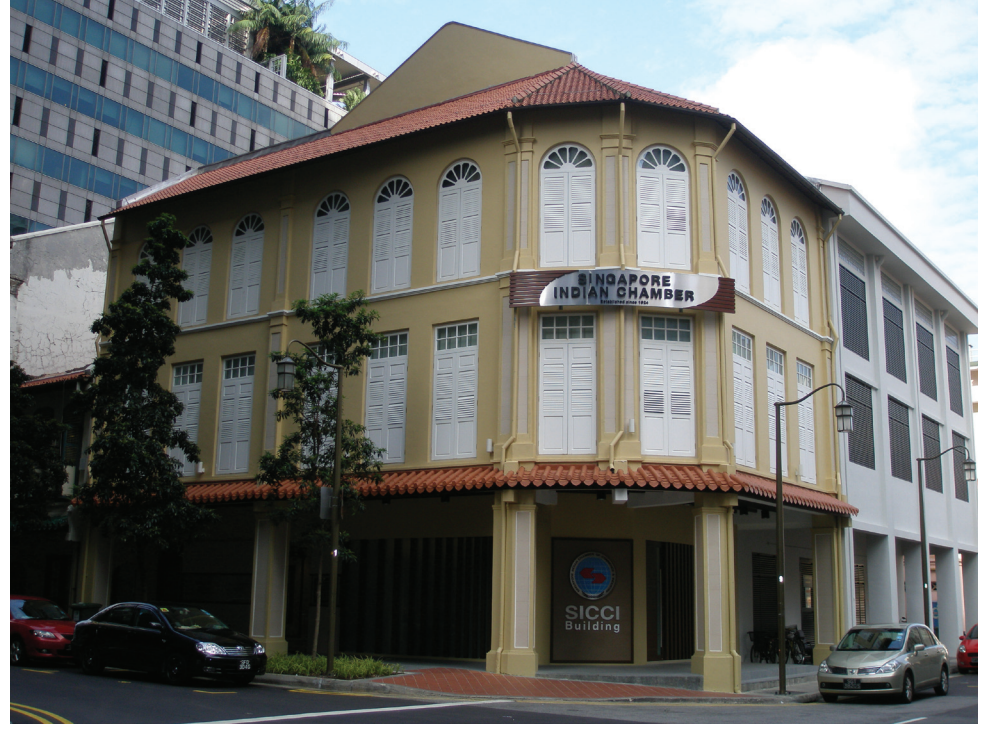
The present Singapore Indian Chamber of Commerce & Industry building at Stanley Street.

Perspective view of High Street buildings, 12 January 1965