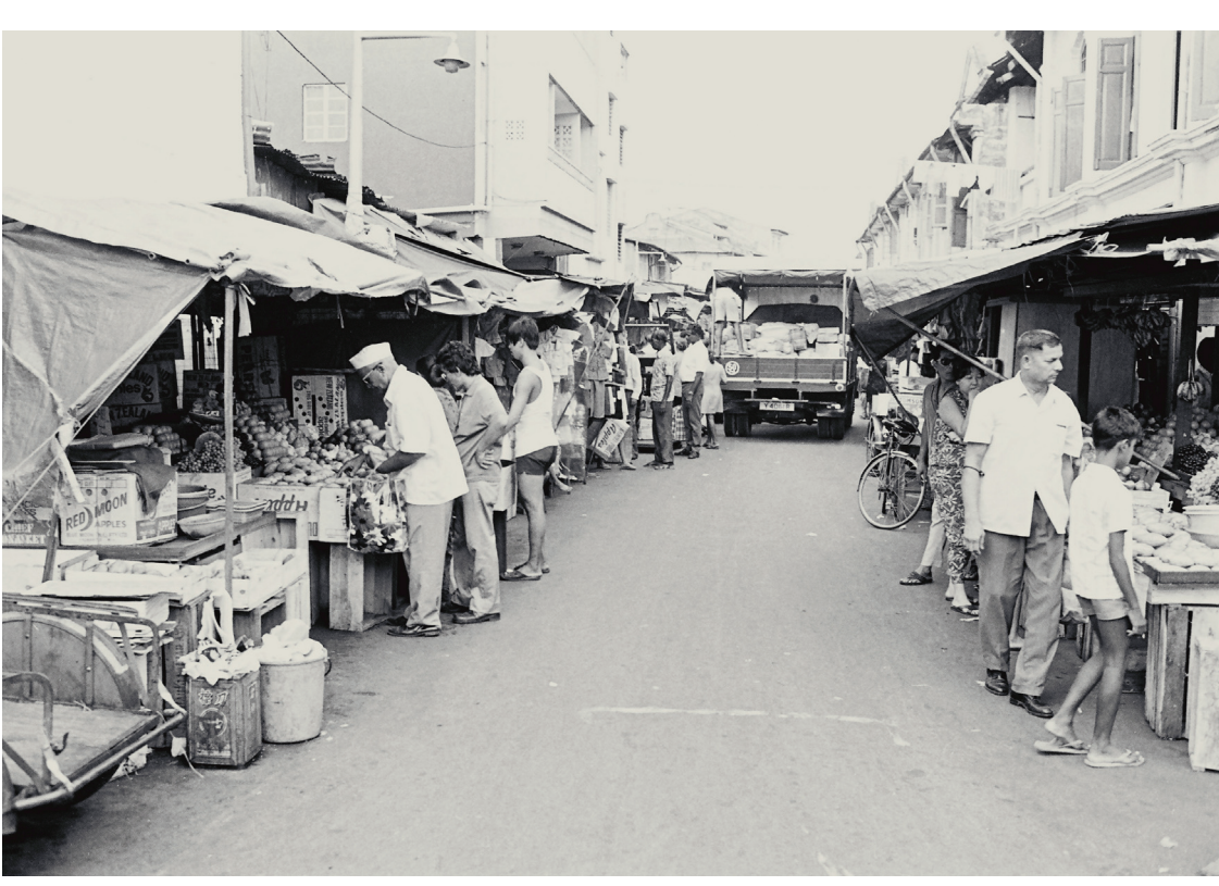
Stalls along Serangoon Road, 8 July 1975

Serangoon Road, Little India, 1980s