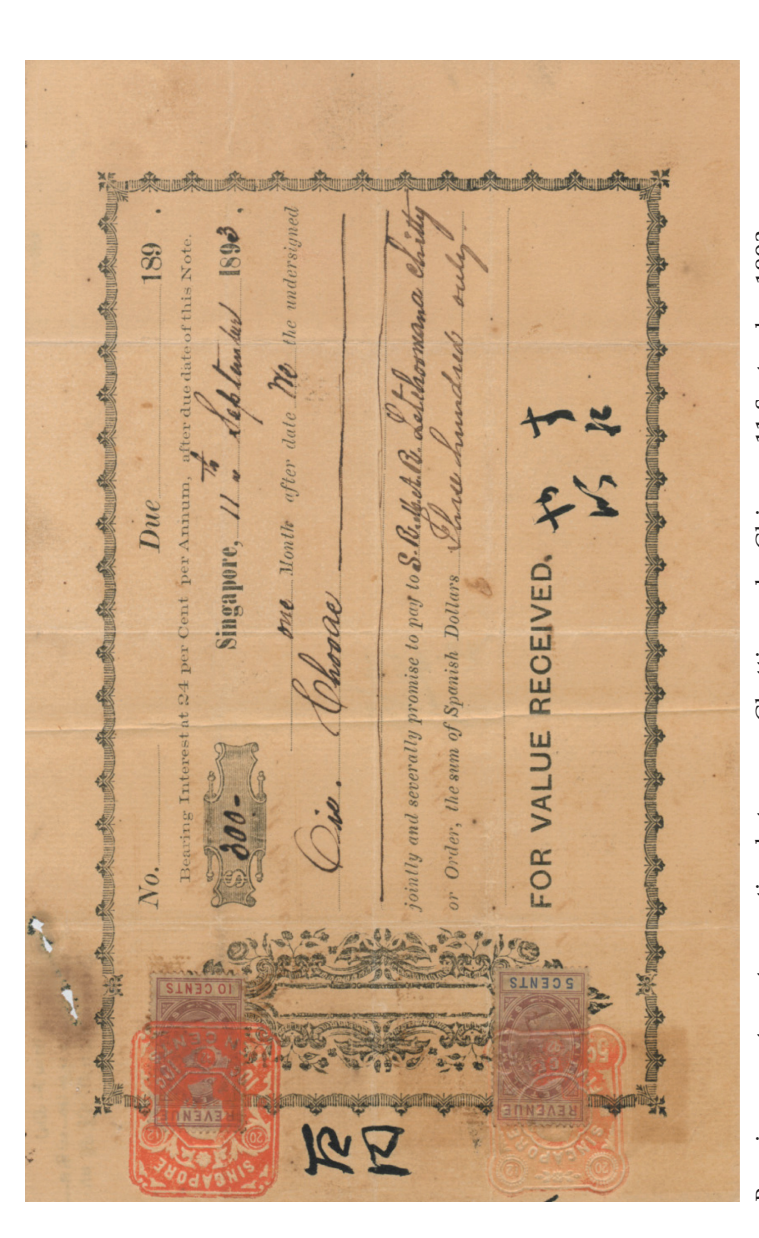
Promissory note — transaction between a Chettiar and a Chinese, 11 September 1893.