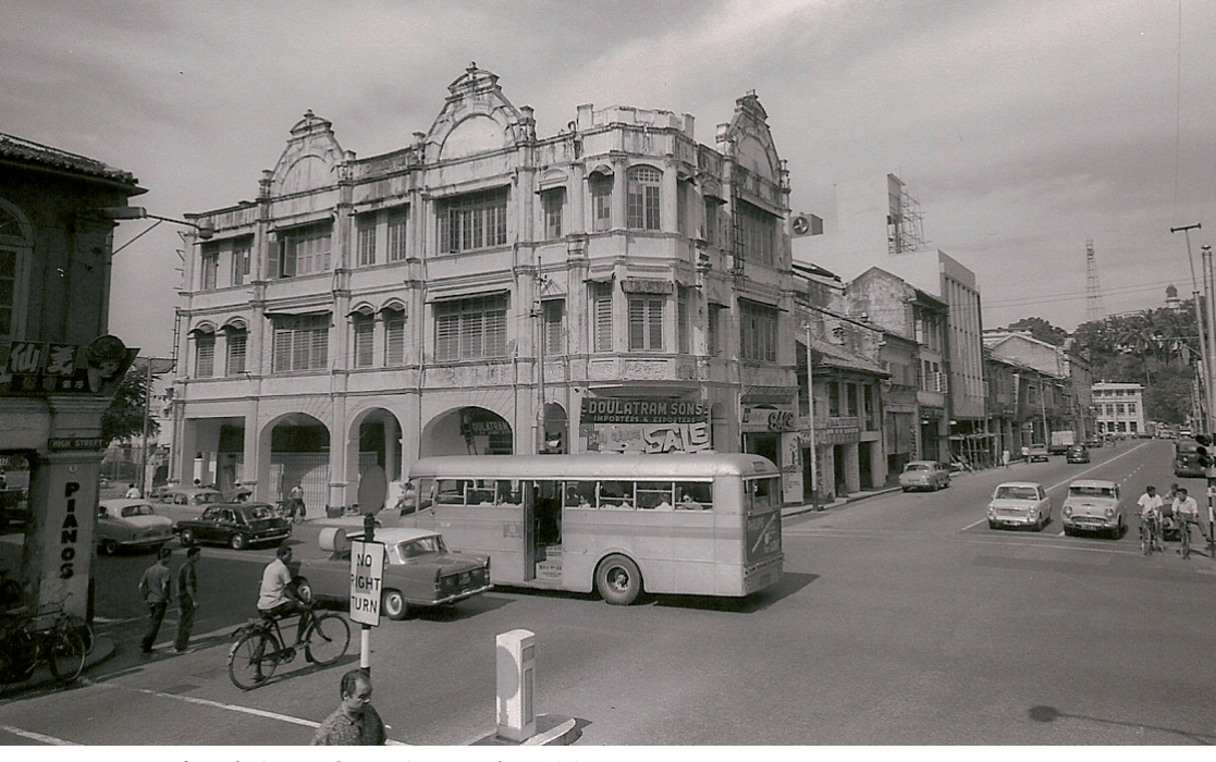
Picture of High Street shops, 2 December 1964

The High Street in 2008.