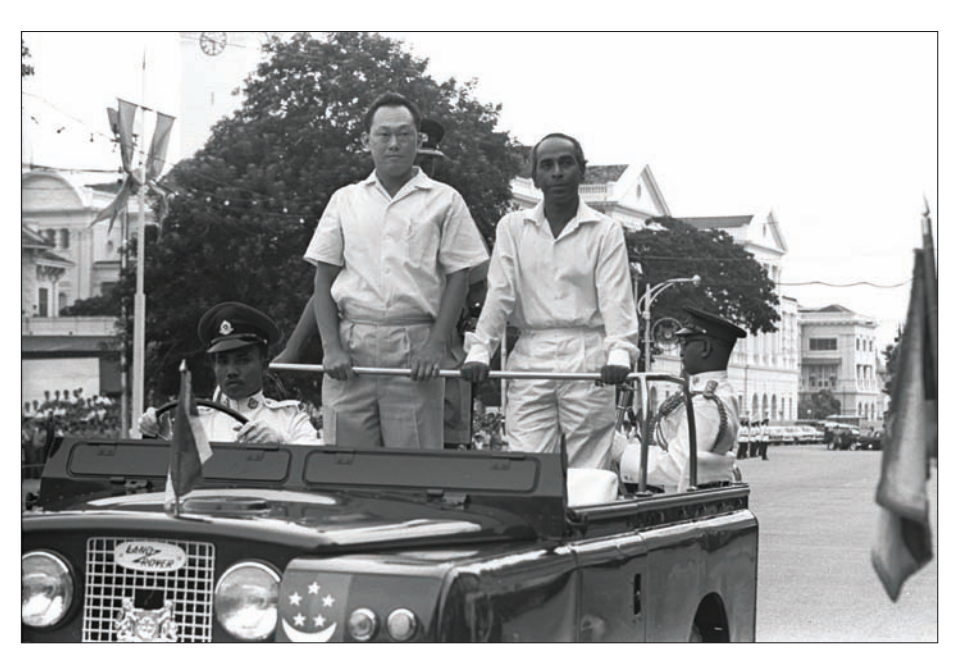
Despite the uncertainty ahead, the two leaders project confidence at the celebrations at the Padang.