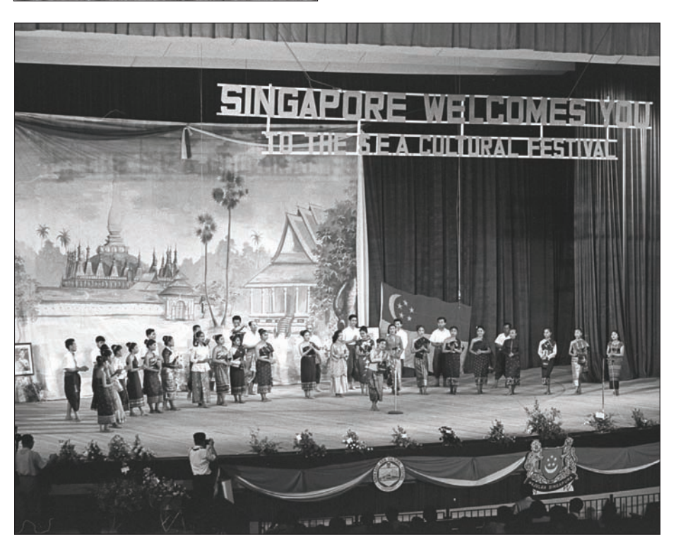
The National Theatre launches the first-ever Southeast Asia cultural festival. 8 August 1963.