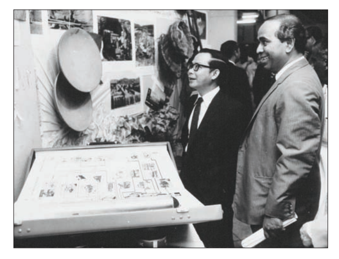
Raja and Toh Chin Chye at a multicultural exhibition during the Malaysia Solidarity Consultative Committee meeting in Singapore, February 1962.