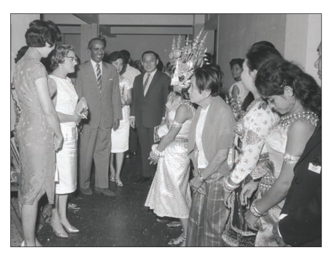
And meets performers backstage in Kuala Lumpur, 23 April 1963. (NAS)