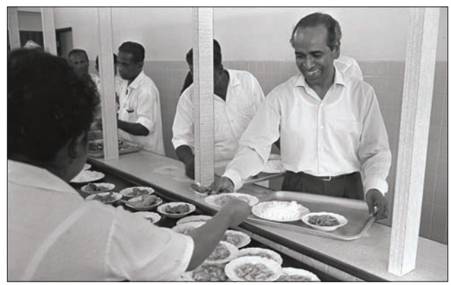
Cultural diplomacy in Malaya: Raja eats with the Singapore "goodwill cultural troupe" in Kuala Lumpur, 22 April 1963. (NAS)